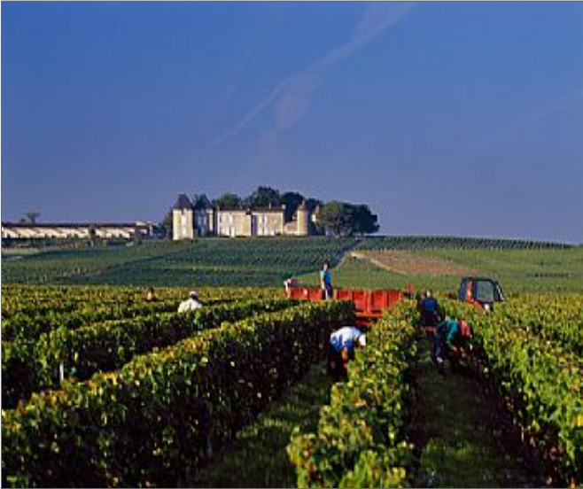
Harvesting in the vineyards of Château Suduiraut in Sauternes with Château d'Yquem in the distance.