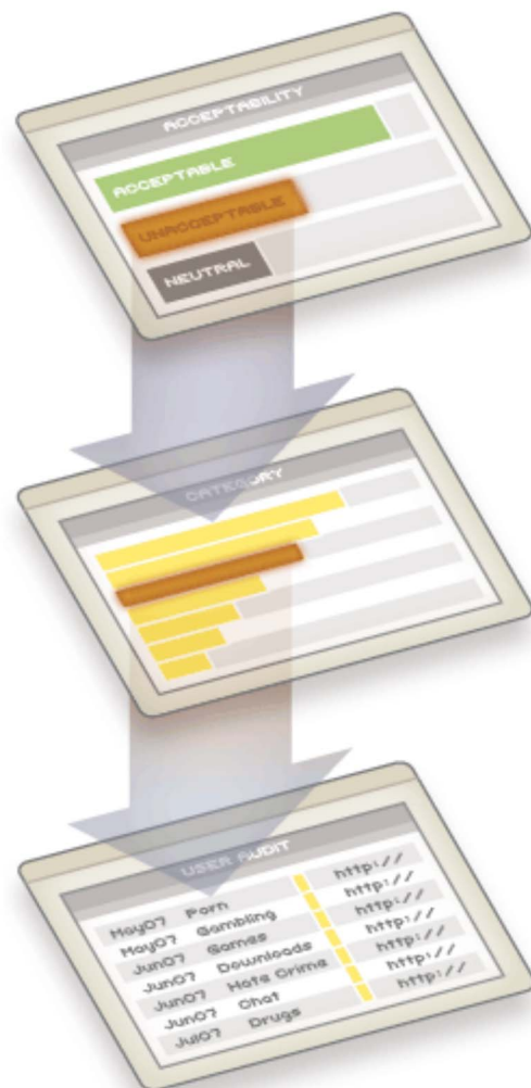
Interactive Drill-Down Reporting