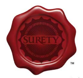
Think of us as the modern-day "Digital Wax Seal"

To learn more about how Surety's AbsoluteProof trusted time-stamp service can help you protect the integrity and legally defend the authenticity of your digital assets, visit www.surety.com.