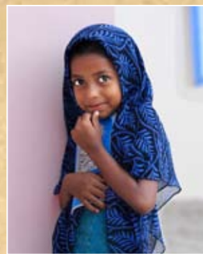
The American Red Cross psychosocial support program in the Maldives worked in schools and communities to help 66,000 people cope with the emotional toll of such a devastating disaster.