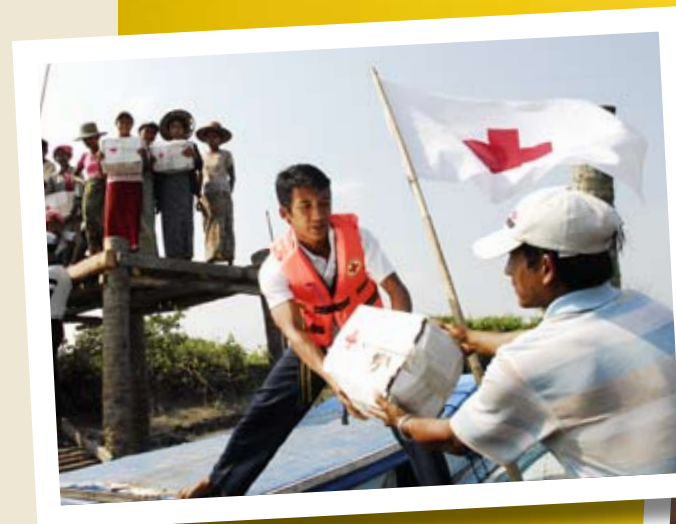
Red Cross volunteers deliver relief supplies to cyclone survivors in Myanmar.

You can help the victims of countless crises around the world each year by making a financial gift to the American Red Cross International Response Fund, which will provide immediate relief and long-term support through supplies, technical assistance and other support to help those in need. Please visit www.redcross.org/international to give.