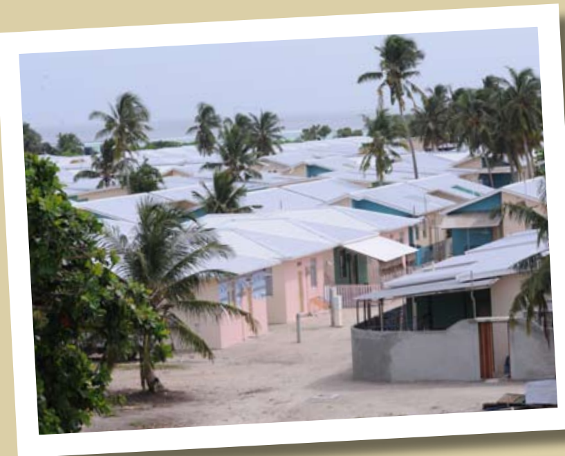
The American Red Cross supported the construction of houses, schools, community buildings, a municipal sanitation system and power supply facility on Dhuvaafaru, Maldives.