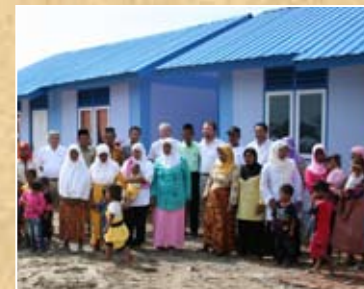
A community in Indonesia gathers with American Red Cross staff to celebrate the handover of their new homes. The American Red Cross and its partners supported the construction of more than 1,600 houses in Indonesia.