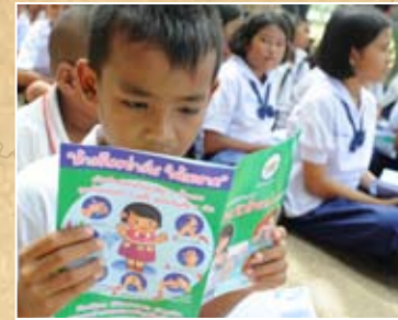
In Thailand, Red Cross employees and volunteers provide students and community-members with information on how to protect themselves against dengue fever, chikungunya and the H1N1 virus. Pamphlets are printed in local languages and distributed widely.