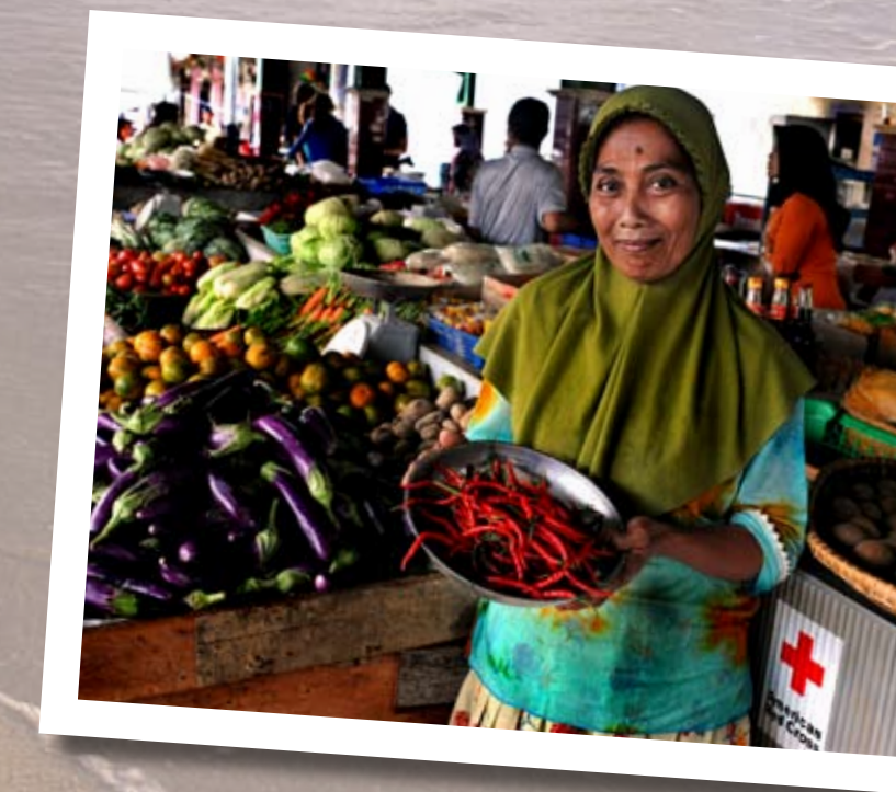
A woman sells chilies in Lhoong, Indonesia in a market rebuilt with support from the American Red Cross. The Tsunami Recovery Program has helped more than 4 million people rebuild their lives following the 2004 tsunami.