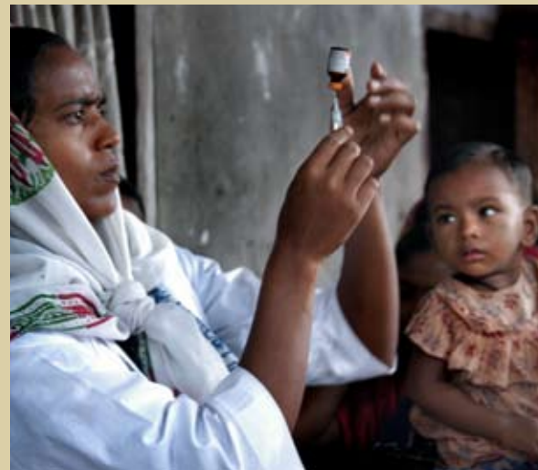
A child in Bangladesh receives a measles vaccination from the Red Cross. American Red Cross funds helped the Measles Initiative reach more than 111 million people in countries affected by the tsunami.

The Measles Initiative, a partnership led by the American Red Cross, United Nations Foundation, U.S. Centers for Disease Control and Prevention, UNICEF and World Health Organization, is committed to reducing measles deaths around the world. American Red Cross funds helped the Measles Initiative reach more than 111 million people in seven tsunami-affected countries with measles and polio immunizations, vitamin A supplements, insecticide-treated bed nets and deworming medication. These campaigns have contributed to the overall success of the Measles Initiative, which between 2001 and 2007 has helped reduce global measles deaths by 74 percent.