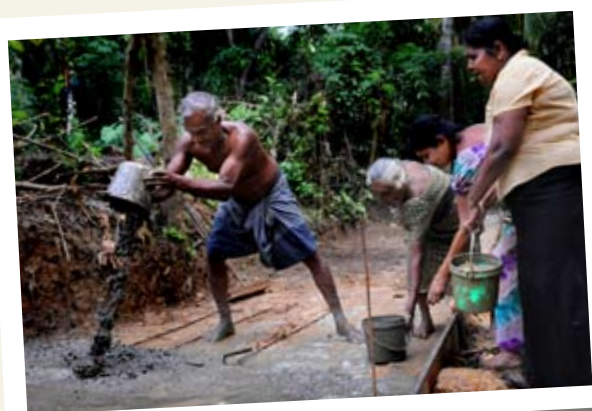
Community members in Sri Lanka help build an evacuation route in case of flooding or another tsunami. This project is one of hundreds of disaster mitigation projects supported by the American Red Cross.

In Sri Lanka, WWF and the Red Cross are helping families adopt environmentally-friendly waste management practices. This woman uses composted solid waste to fertilize her fruit and vegetable garden, which helps increase household savings and improve nutrition.