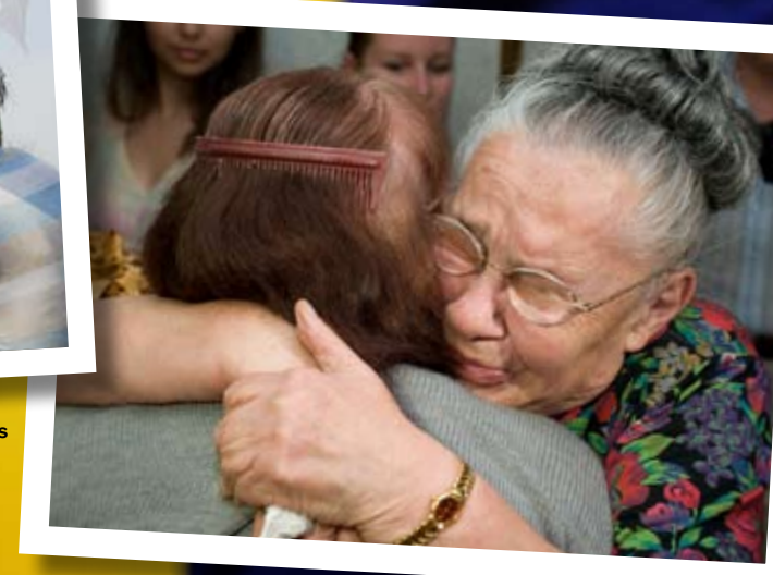
Red Cross organizations around the world work together to reunite separated loved ones through the Restoring Family Links program.