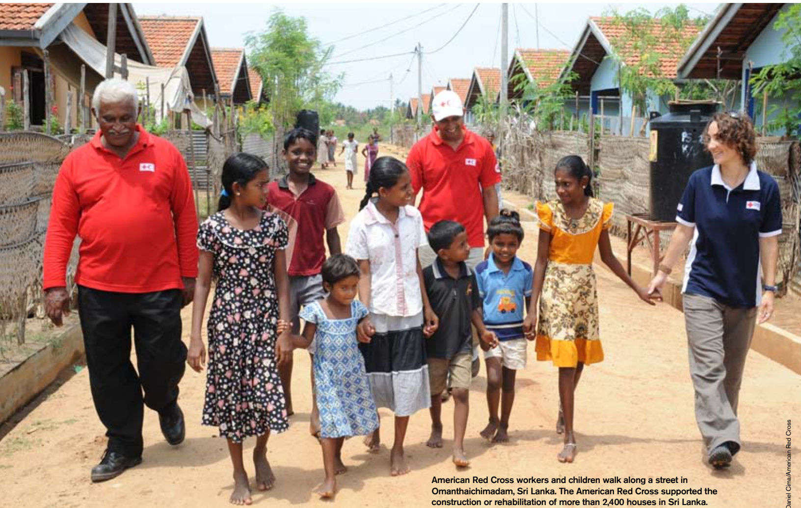
American Red Cross workers and children walk along a street in Omanthaichimadam, Sri Lanka. The American Red Cross supported the construction or rehabilitation of more than 2,400 houses in Sri Lanka.