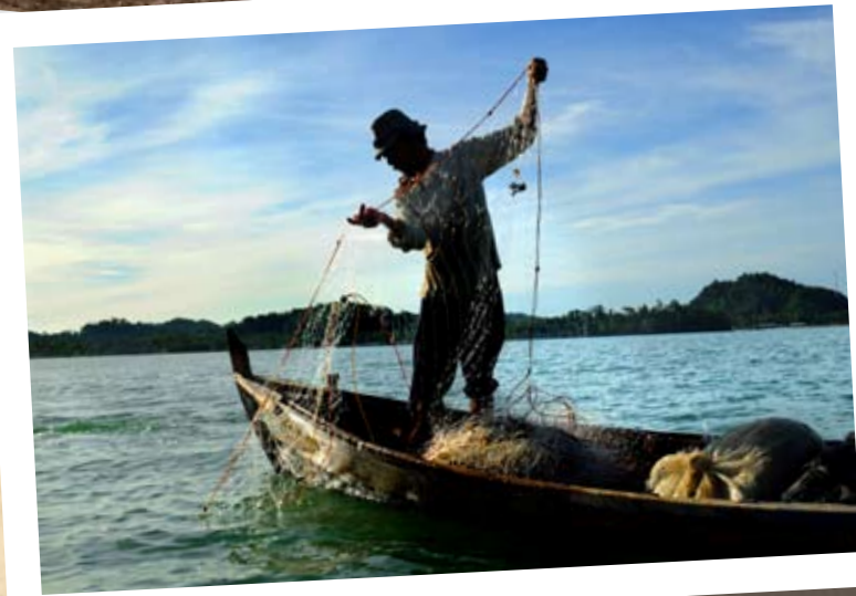
In Indonesia, the tsunami killed more than 160,000 people and left 500,000 homeless. The American Red Cross responded immediately and has carried out more than 80 recovery projects in the region.