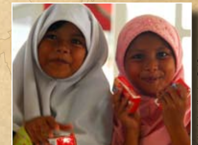
Two Indonesian students show off the soap they received from a hand washing campaign in Aceh Besar. Through programs like this one, the American Red Cross has reached more than 76,100 people with messages on how to improve health and avoid disease through better hygiene practices.