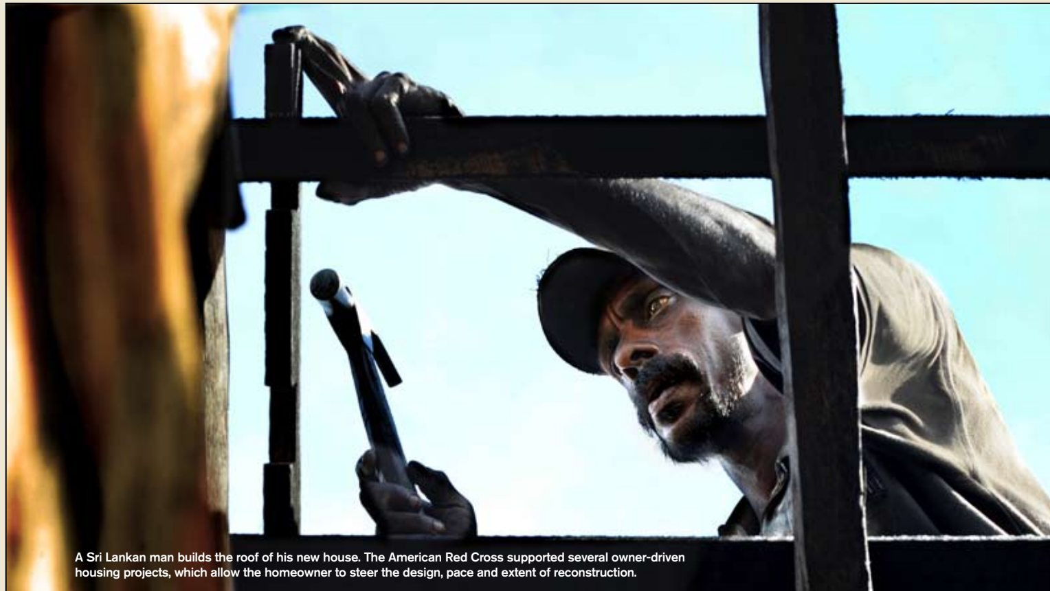
A Sri Lankan man builds the roof of his new house. The American Red Cross supported several owner-driven housing projects, which allow the homeowner to steer the design, pace and extent of reconstruction.