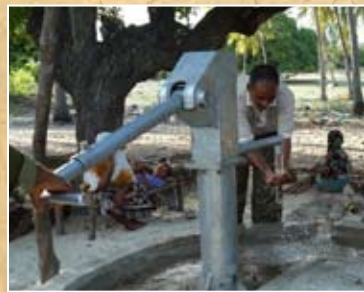
The water source pictured here is one of many provided by the Red Cross in coastal areas of Kenya. This project, which benefited 45,000 people, also improved sanitation systems and taught hygiene promotion.