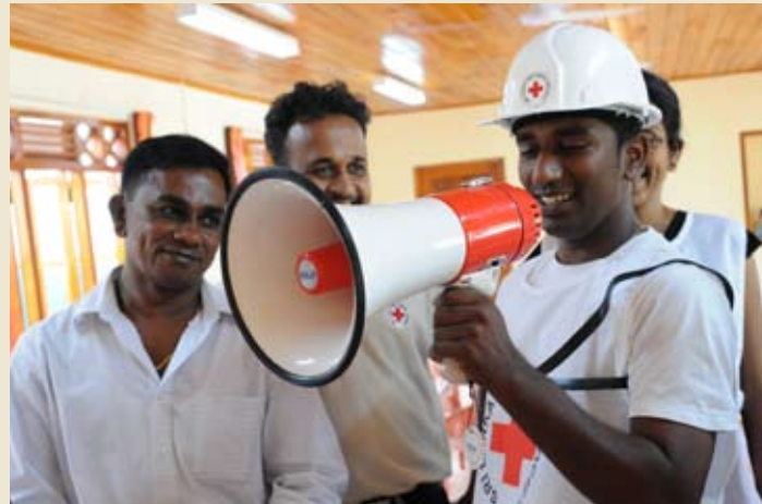
Sri Lanka Red Cross Society workers test their new disaster response equipment.

Because of the scale of devastation and massive needs caused by the tsunami, the American Red Cross recognized the importance of forging strong partnerships with NGOs, U.N. agencies and local governments. These