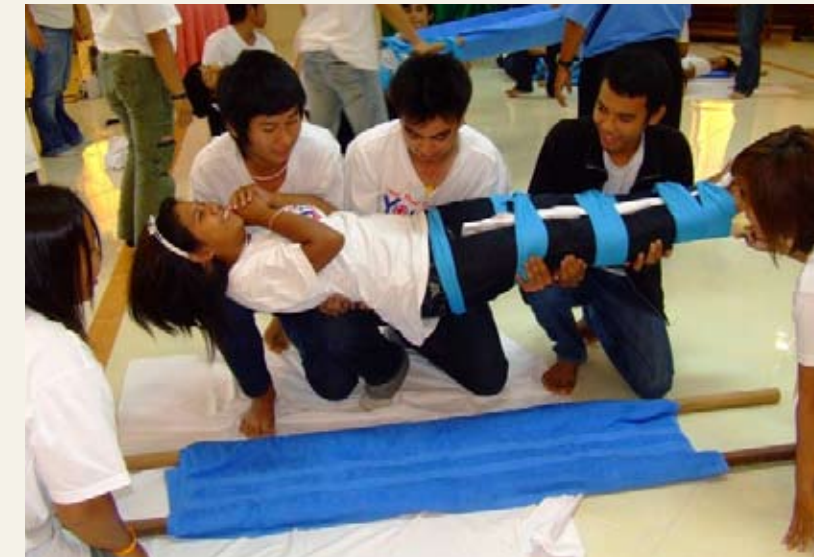
This project in Thailand is training thousands of youth in basic and advanced first aid to bolster the Thai Red Cross Society's ability to respond to emergencies.