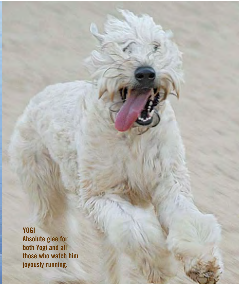
YOGI Absolute glee for both Yogi and all those who watch him joyously running.