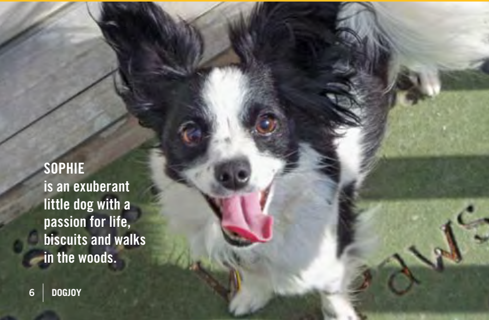
SOPHIE is an exuberant little dog with a passion for life, biscuits and walks in the woods.

Sammy loved to hunt for lizards, which were abundant in our backyard on Iberville Street in New Orleans, where we lived before Hurricane Katrina. But he didn't have much luck catching them. So on this day when his daddy arrived home from work with a lizard for him, Sammy was beside himself with joy.