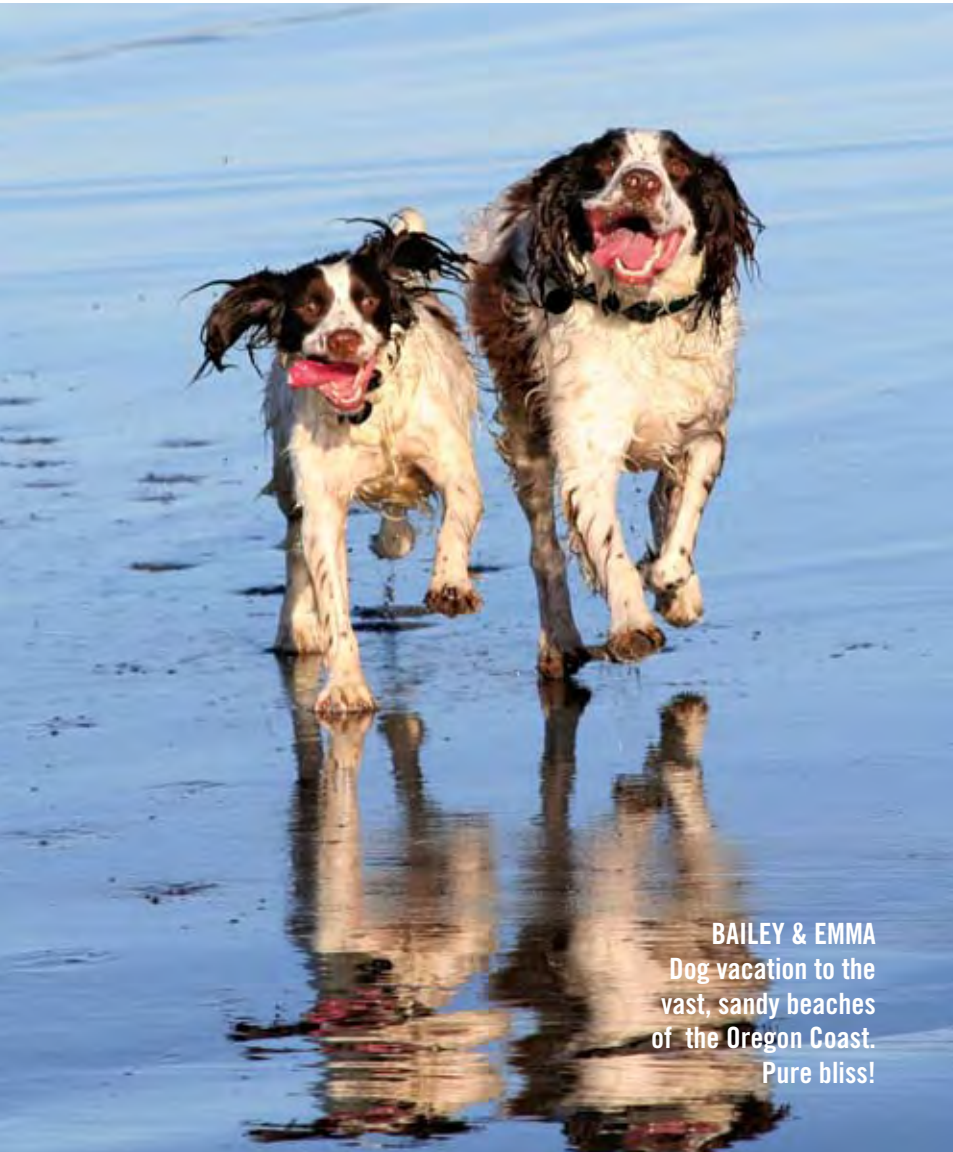
BAILEY & EMMA Dog vacation to the vast, sandy beaches of the Oregon Coast. Pure bliss!