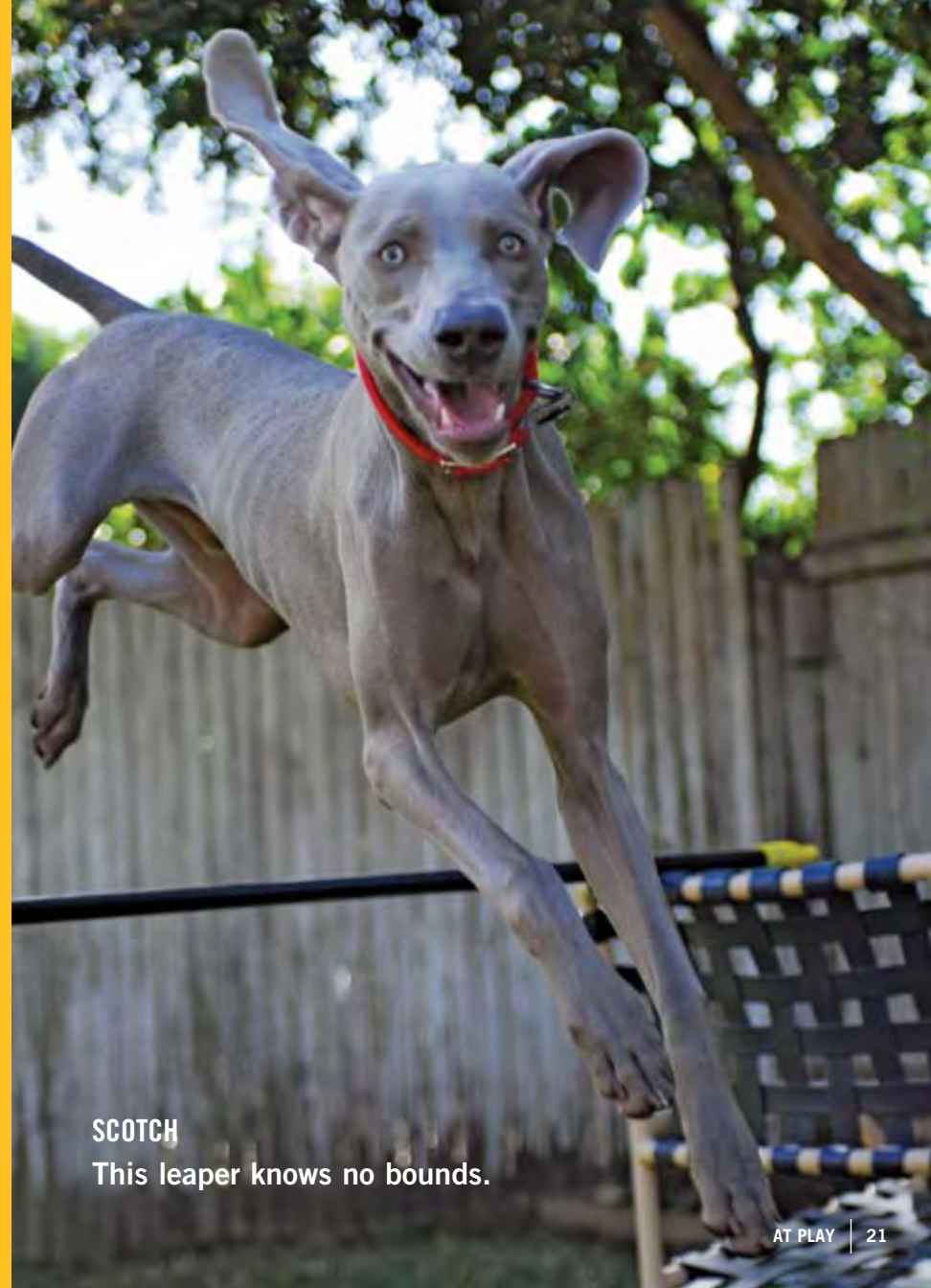
SCOTCH This leaper knows no bounds.

There are the reach-for-the-sky leaps, the tug-tug-tugs with a holey sock, the squirm-on-the-back moments, the you-can't-catch-me dashes around the yard. But no matter what the playtime inclination, the “this-is-a-blast” ear-to-ear beaming is a happy constant.