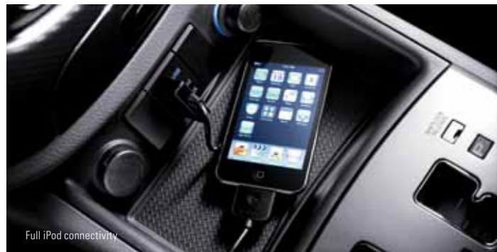
Full iPod connectivity