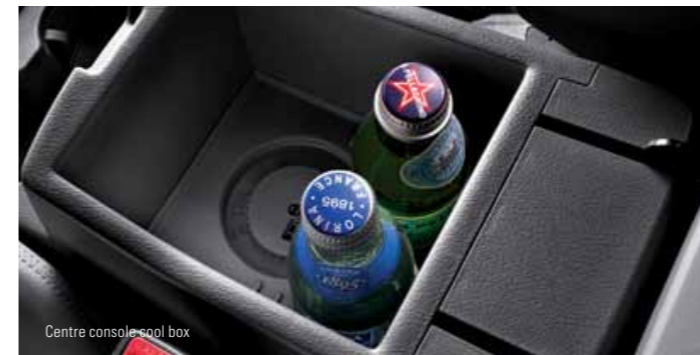
Centre console cool box