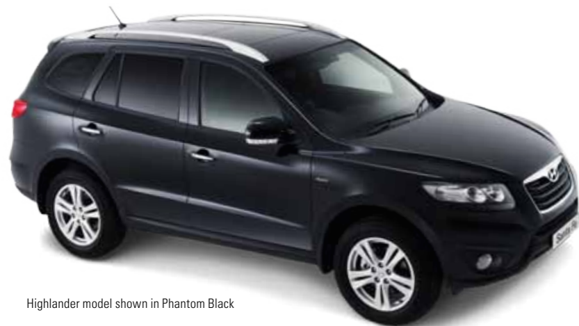
Highlander model shown in Phantom Black

An extensive dealer network and full warranty support means your confidence in your Hyundai need never be compromised.