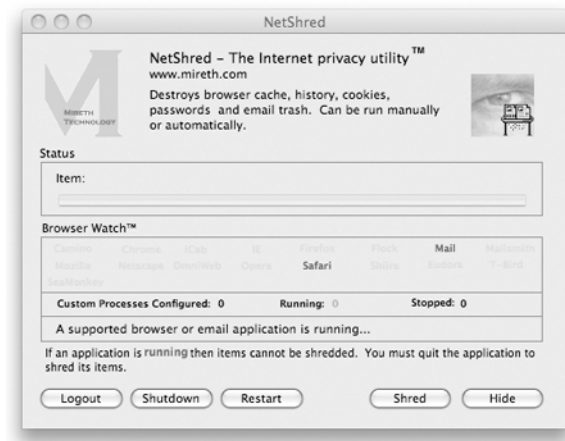
Figure 3: NetShred X Main Dialog