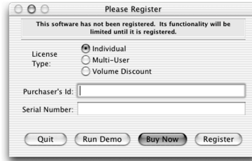
Figure 1: Registration Dialog

Quit – to quit the program, click the “Quit” button