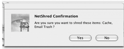
Figure 2: NetShred X Confirmation Dialog