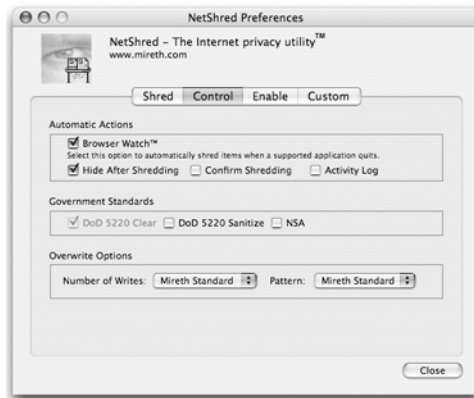
Figure 5: Preferences for running NetShred X automatically