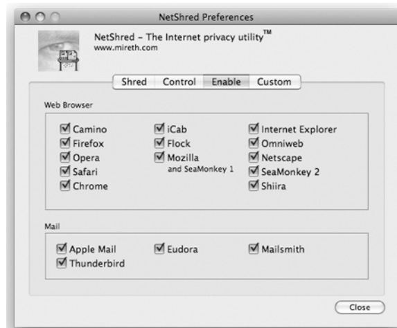
Figure 6: Preferences Enable Tab

Often, customers will enable only a single browser, for example Firefox, and then always use that browser for private browsing. By using Netshred with 2 browsers you can keep history and cookies for your typical browsing and shred them for your private browsing.