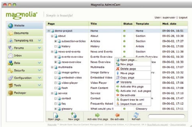
Managing content in the intuitive editor's workbench.