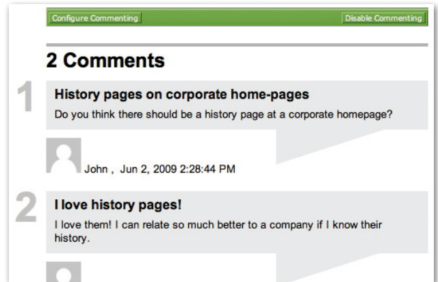
Enable and manage User Generated Content (UGC).