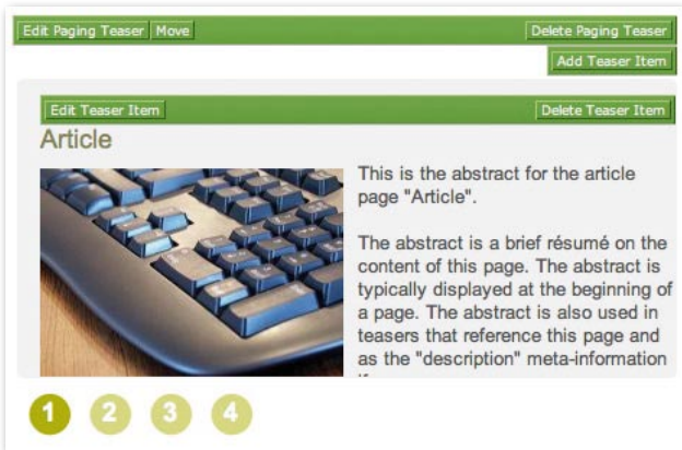
Ready-made elements such as teaser, news, event, etc.