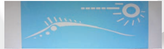
Selective application of tape can be very precise