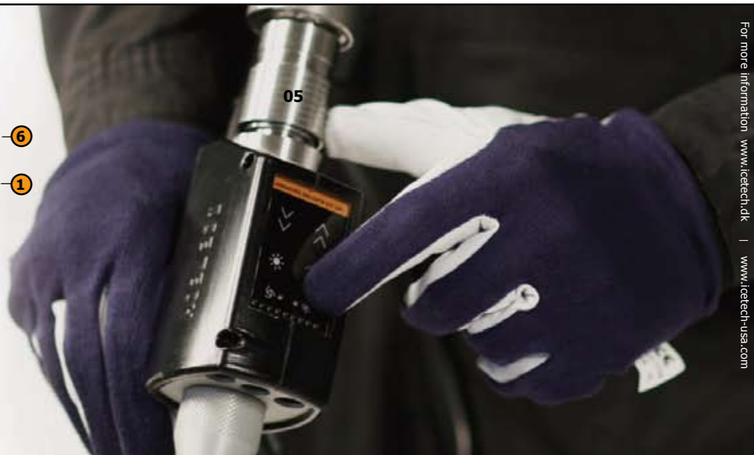
01 : 06