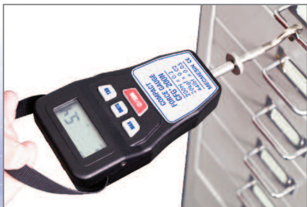
Tensile Test on a Drawer