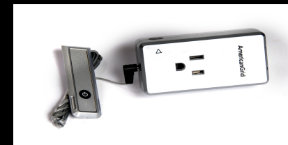
AG Appliance Controller - monitors status of the appliance and enables remote control