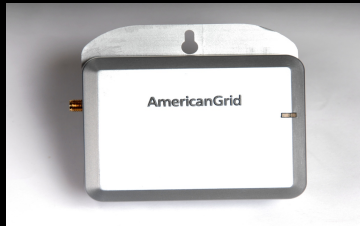
AG 102 Energy Monitor - monitors whole house energy usage at the control panel