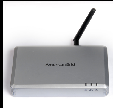
AG 101 Energy Gateway - monitors status of all appliances every 5.4 sec. reports to data center.