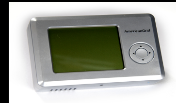
AG Thermostat - monitors temperature and displays instant energy $ usage.