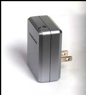
AG 104 Repeater - access point repeats signals