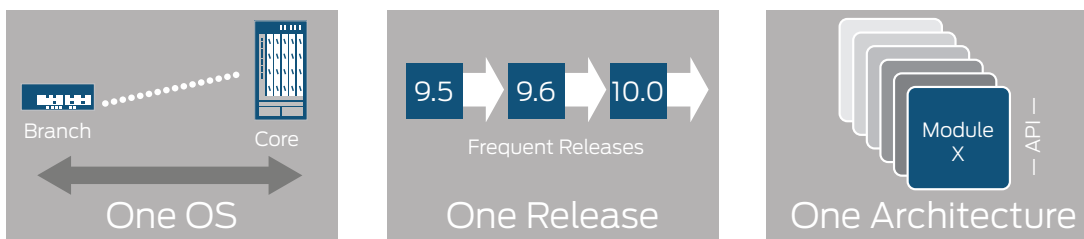
Junos OS uses a single source code, adheres to a consistent and predictable release train, and employs a single modular architecture.