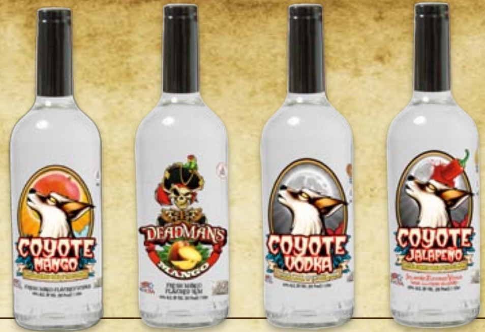
Fresh Mango Flavored Vodka Fresh Mango Flavored Rum Award-winning 90-Proof Vodka Fresh Jalapeño Flavored Vodka

COMPETITIVE 'HOWLING AT THE FULL MOON' CONTESTS WITH OUR COYOTE VODKAS