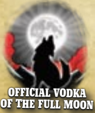
OFFICIAL VODKA OF THE FULL MOON

We want to help you build your bar business – month after month – with offbeat promotions, fun events and unique cocktails that celebrate our trademark characters.