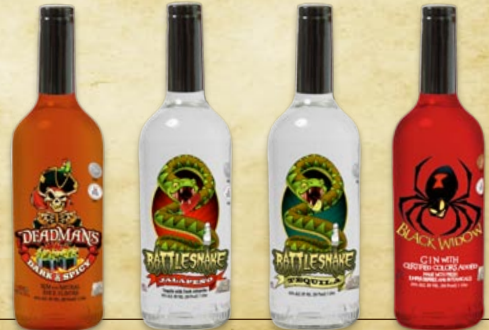
Rum Made with Natural Spice Flavors Tequila with Fresh Jalapeño Mexican Blue Agave with just the Right Bite Gin with Fresh Juniperberries & Botanicals