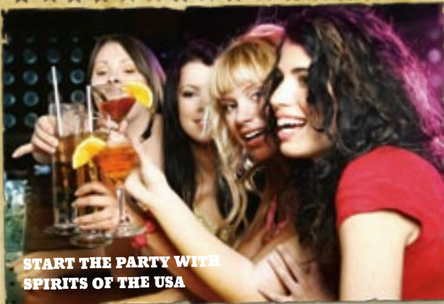
START THE PARTY WITH SPIRITS OF THE USA

Introducing, the first full line of 100% American-made premium spirits. Spirits of the USA puts the power back into the bottle to create sophistication, taste and value for our customers.