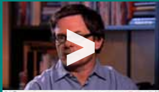
MICHAEL J. FOX