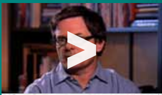
MICHAEL J. FOX