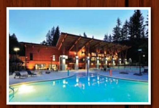
CULTUS LAKE: Only a short 90 minute commute from Vancouver.