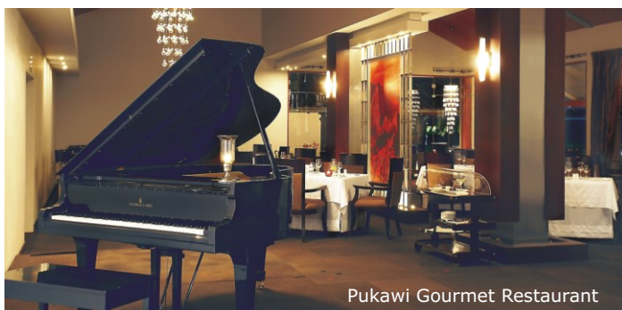
Pukawi Gourmet Restaurant