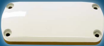
Externally mounted antenna

Guardian uses Iridium and Globalstar satellite coverage to provide flight following and asset management products and services to aircraft operators worldwide. Guardian products offer the industry's best value in a high-performance complete flight tracking solution that is easy to use and requires little to no installation. Unlike other tracking products, Guardian 3 devices transmit on take off and landing, giving accurate trip summaries.