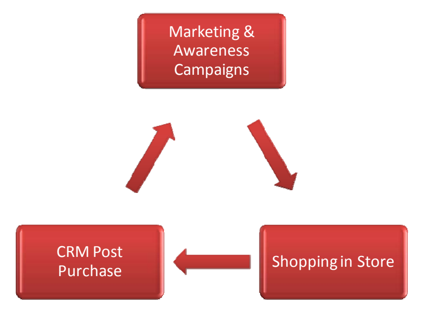
Figure I: The Retail Customer Journey