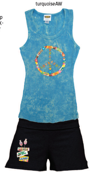
Multi-Candy 4 TR69A-YO-black