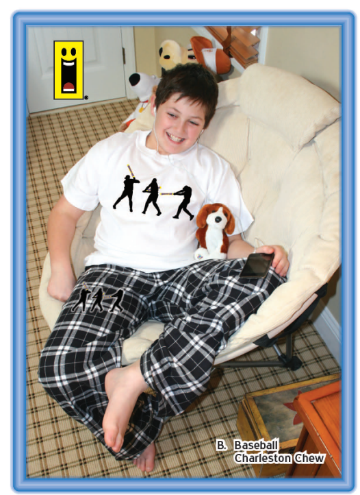
Sizing: YXS*, YS, YM, YL, AS, AM, AL (*Only available in pink/black and royal blue flannel pants and sets.)