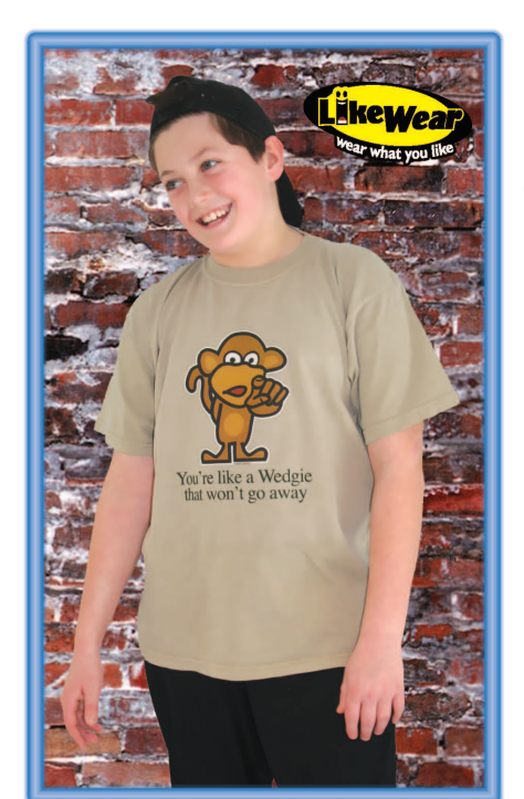
Wedgie AB2-BSS-vintage khaki