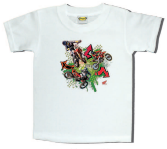
Honda Big Boy Bike H3-BSS-white