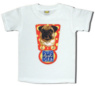
Pug Off AB3-BSS-white