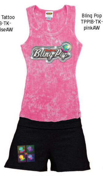
Warhol Ring Pop TPP2A-YO-black