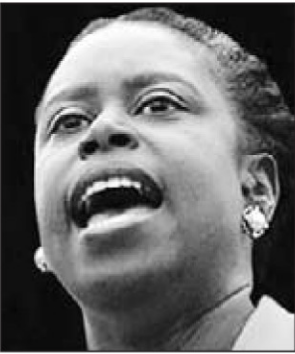
Rep. Cynthia McKinney