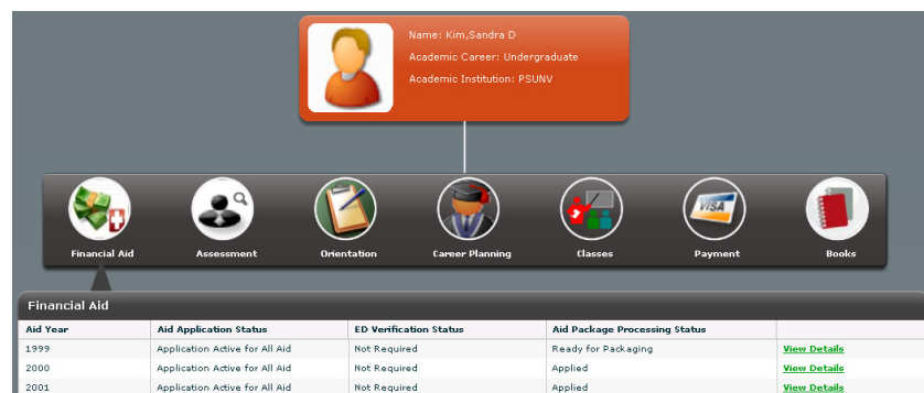
Figure 2. This student enrollment process shows related financial aid, classes, payments, and books.