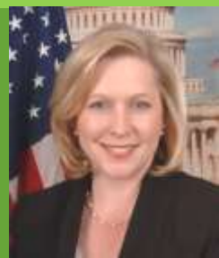
Hon. Kirsten Gillibrand US Senator for New York Environmental Committee