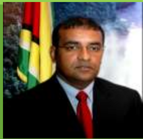
H.E. Excellency Bharrat Jagdeo PRESIDENT Republic of Guyana