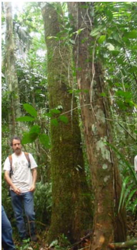
Ron is looking for the perfect wood that sings.

This is the process, for example, used to create Marimba One's