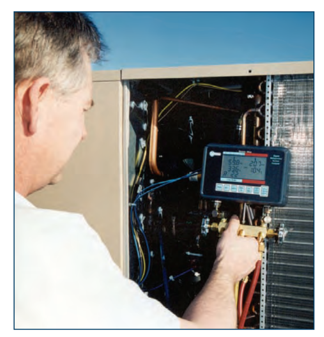
Don't have a refrigerant manifold gauge? Consider a digital refrigerant system analyzer. Automatic subcooling and superheat readings make it easier to determine the proper refrigerant charge.

Incorrect refrigerant charge can affect a direct expansion (DX) unit's energy efficiency significantly (Figure 1). A recent field study of 74 refrigeration systems reported that over 40 had incorrect refrigerant charges. Correcting the refrigerant charge can reduce cooling costs from 5 to 10 percent. Therefore, it is important to verify the correct refrigerant charge in your systems. Some signs indicating an undercharged system include frosting on the evaporator entrance, a warm suction line, a cool liquid line, warm supply air, and continuous compressor operation. In an overcharged system, on the other hand, excess liquid refrigerant backs up in the condenser and therefore increases the head pressure. Solution: Determine if refrigerant charge is acceptable, insufficient or excessive. Using the manufacturer's chart, look up the evaporating temperature that corresponds with the measured suction line pressure. Measure the actual suction line temperature. Determine the superheat as the difference between the measured suction line temperature and the evaporating temperature from the chart. For most direct expansion systems, a superheat temperature between 10°F and 20°F indicates an adequate refrigerant charge. For systems with thermal expansion valves, the