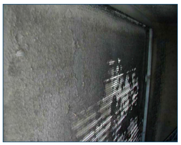
Filthy Cooling Coils Restricting Airflow and Cooling Effectiveness. Closer inspection revealed missing air filters.

A dirty evaporator coil or condenser coil will reduce cooling capacity and degrade equipment energy efficiency. A clogged evaporator coil reduces air flow through the coil, thus causing the compressor motor to consume more energy. Exposed to unfiltered outdoor air, condenser coils easily trap dust and debris, which raises the condensing temperature and reduces the cooling capacity. A Pacific Gas & Electric (PG&E)