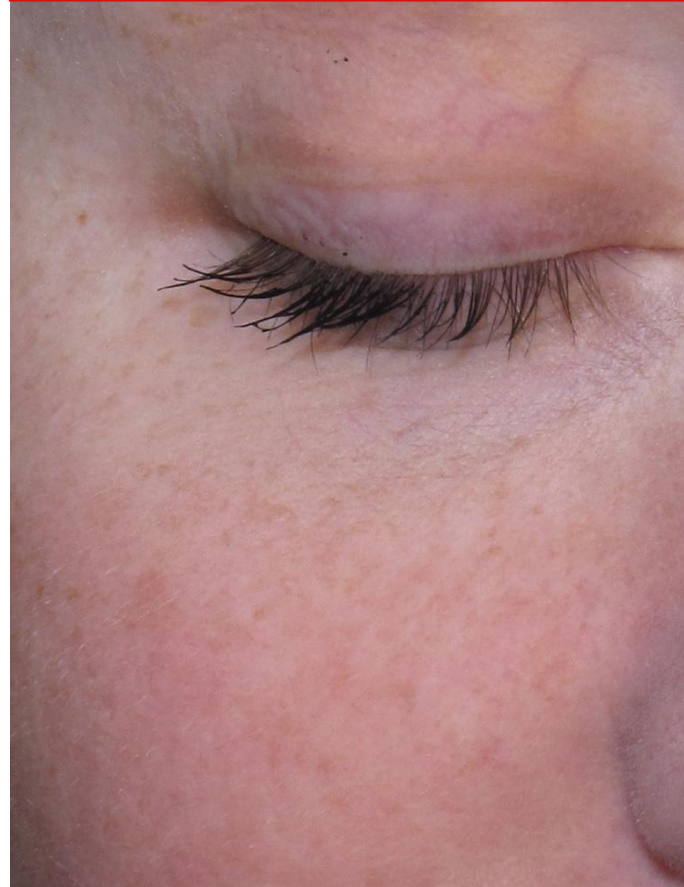
AFTER 90 DAYS USAGE

Dramatic fading in sunspots on cheek area. Healed Rosacea in nose area.