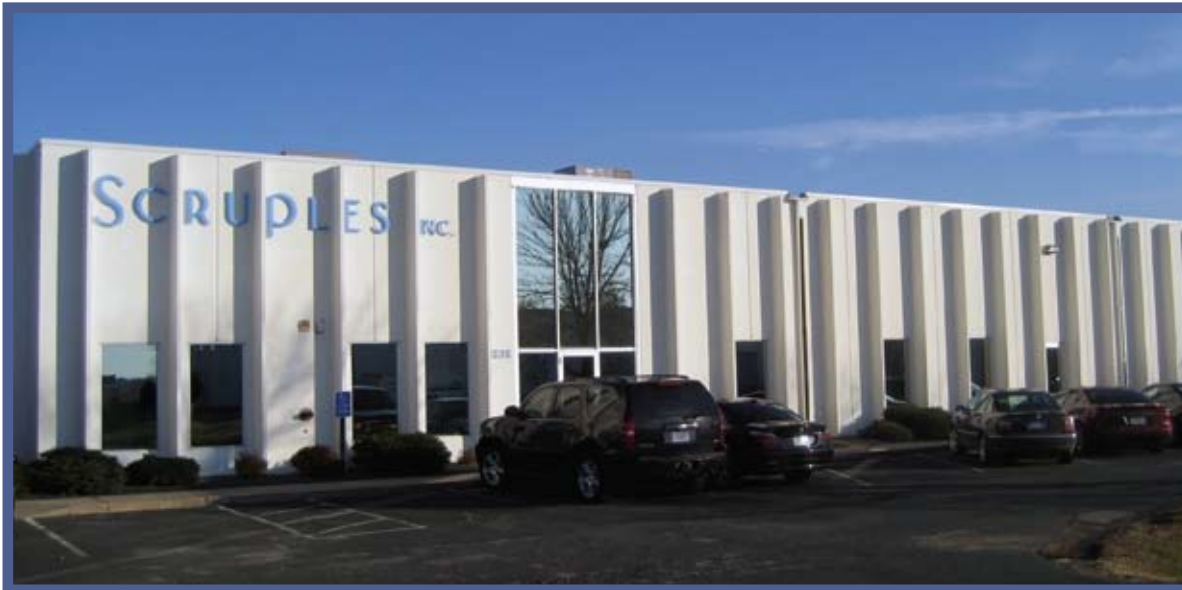
Scruples Corporate Headquarters - Minneapolis, Minnesota