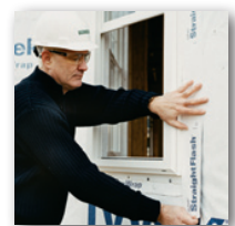
DuPont™ FlexWrap™ and DuPont™ StraightFlash™ are designed to be compatible with the DuPont™ Tyvek® Weatherization Systems.

DuPont™ StraightFlash™ – This product, made from DuPont™ Tyvek® and a premium butyl adhesive, is designed to protect the heads and jambs of rectangular windows which can be subjected to wind-driven rain. It compliments the use of DuPont™ FlexWrap™.