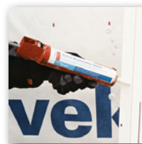
DuPont™ Tyvek® Tape, DuPont™ Tyvek® Wrap Caps and DuPont™ Weatherization Sealant, integral parts of DuPont™ Tyvek® Weatherization Systems.