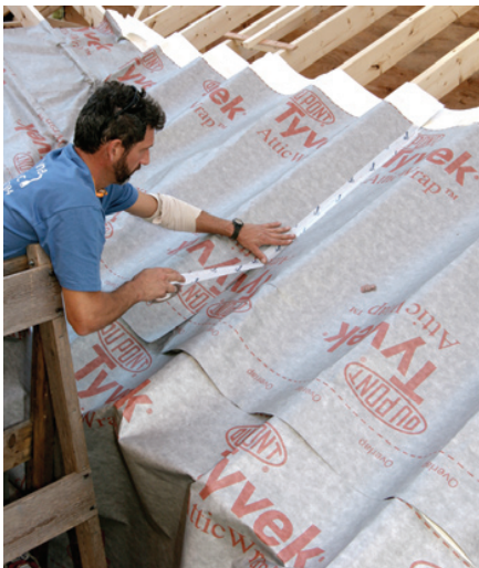
DuPont™ Tyvek® AtticWrap™ is a breathable membrane that helps create a sealed attic system, reducing air leakage and energy loss through the roof.