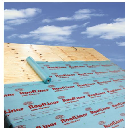
DuPont™ RoofLiner with Elvaloy® an easy-to-use roofing underlayment.

DuPont™ Weatherization Sealant is scientifically formulated to bond with DuPont™ Tyvek® Weatherization Systems products, helping create a breathable, protective barrier to increase energy efficiency, reduce heating and cooling costs, and help protect against water infiltration.