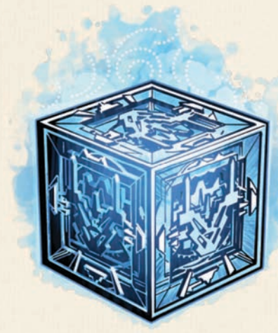
1.2 JEDI HOLOCRON

The Upper Manderon and Draggulch transcriptions add moreand controversial—tenets, but the Jedi need only to remember the core teachings to live their lives as gifted, yet humble, defenders of justice.