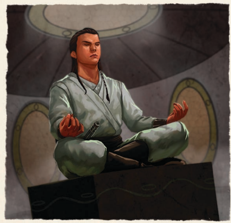
<sup>1.1</sup> Meditation brings peace, harmony, and serenity—three of the five precepts of THE JEDI CODE.

or forty years, the Jedi Code has been my focus, as it will become yours. It is the philosophy upon which stands the Jedi Order. It is a pledge of protection to the citizens and inhabitants of the Republic. It is an encapsulation of our relationship with the Force. As a Jedi, you must be faithful to the spirit of the Code. Every day you must ask yourself: Do I understand it?