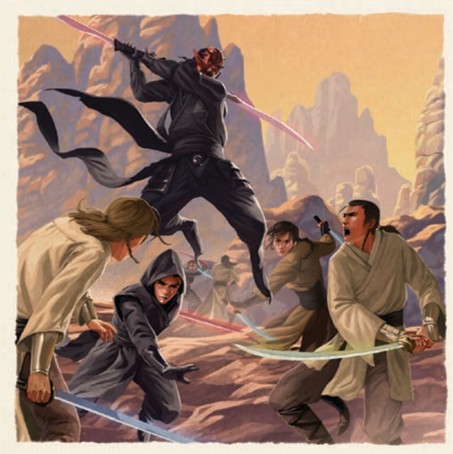
1.4 The Force Wars of Tython, fought with Force-forged swords, were THE FIRST CLASHES BETWEEN THE LIGHT AND THE DARK SIDE.

The Force Wars were fought with swords, their metal blades Forceenhanced for strength and sharpforebears had discovered it is difficult to wield a weapon that 1 act as if it is an extension of one's own body. With technology from offworlders, the earliest lightsabers came into existence—and became the symbols of the Order.