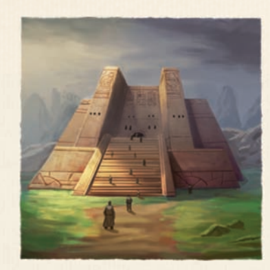
THE EYE OF ASHLANAE WAS THE CENTER OF JEDI CULTURE ON OSSUS FOR OVER 12,000 YEARS.

its peaceful formation in the Core Worlds, the Jedi Knights vowed to defend its ideals of exploration, knowledge, and justice.