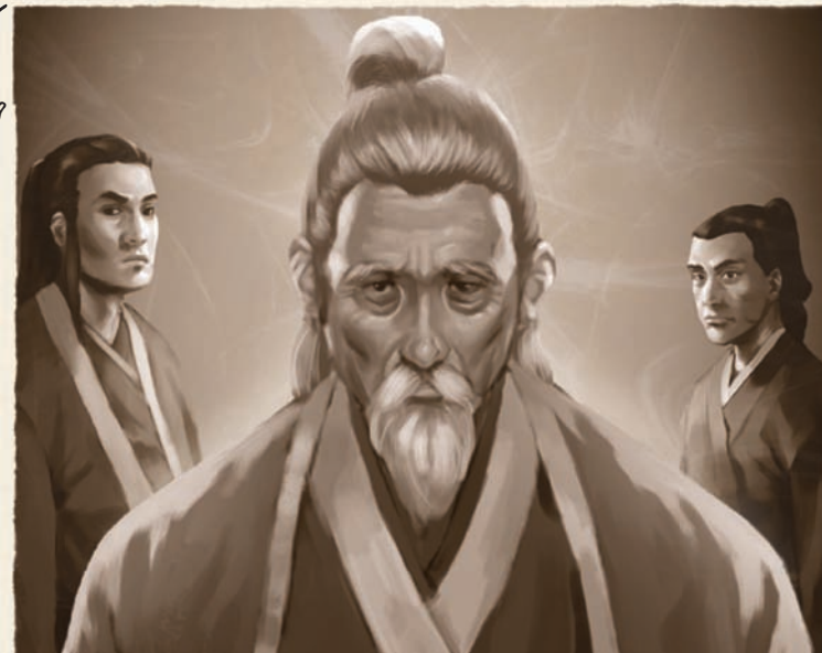
^{ m I.3} Qui-Ko is one of the few seers of Tython whose writings on the nature of Ashla HAVE SURVIVED TO THE PRESENT.

TO REJECT TEACHINGS CAN WE CARE? THERE'S A WAR ON! -AHSOK,