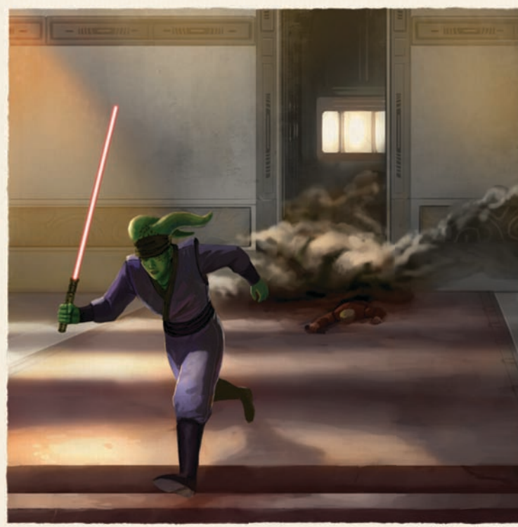
1.6 More than 2,600 years ago, the Treaty of Coruscant led to a Sith betrayal and a weakened Jedi Order.