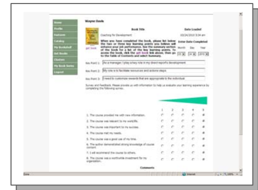
Evaluate and link to performance