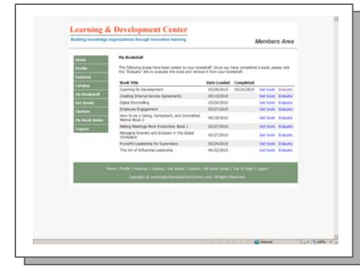
Put resource in My Bookshelf