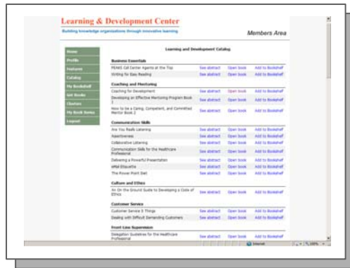
Open catalog, see abstract review and select book