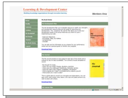
Select from My Book Series