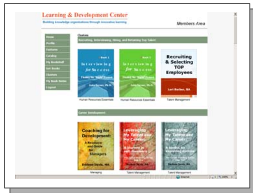
Check out the learning clusters