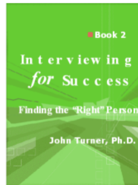
Human Resources Essentials