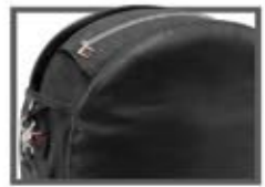
Luna Shoulder bag