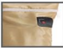
Baby Changing Kit