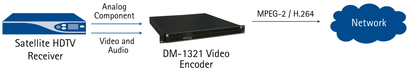
Figure 1. Example Usage for DM-1321 MPEG-2/H.264 Video Encoder