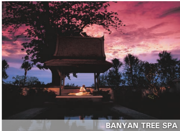
BANYAN TREE SPA