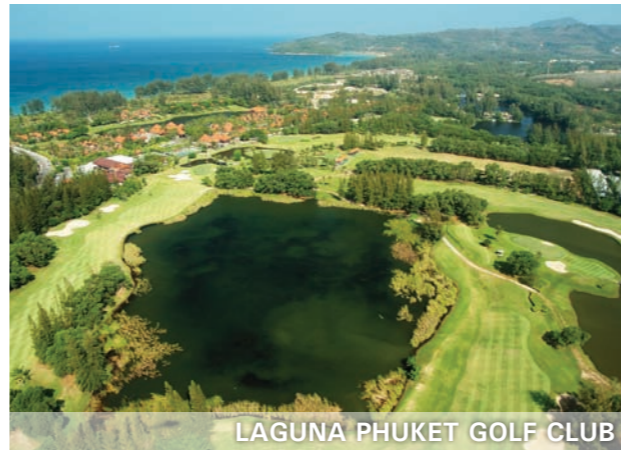
LAGUNA PHUKET GOLF CLUB