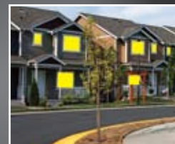
With Privacy Zones