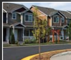
Without Privacy Zones

The inclusion of privacy zones is increasingly becoming a requirement for outdoor surveillance.