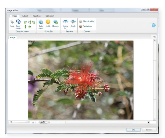
Edit photos directly in the application with the Image Editor.