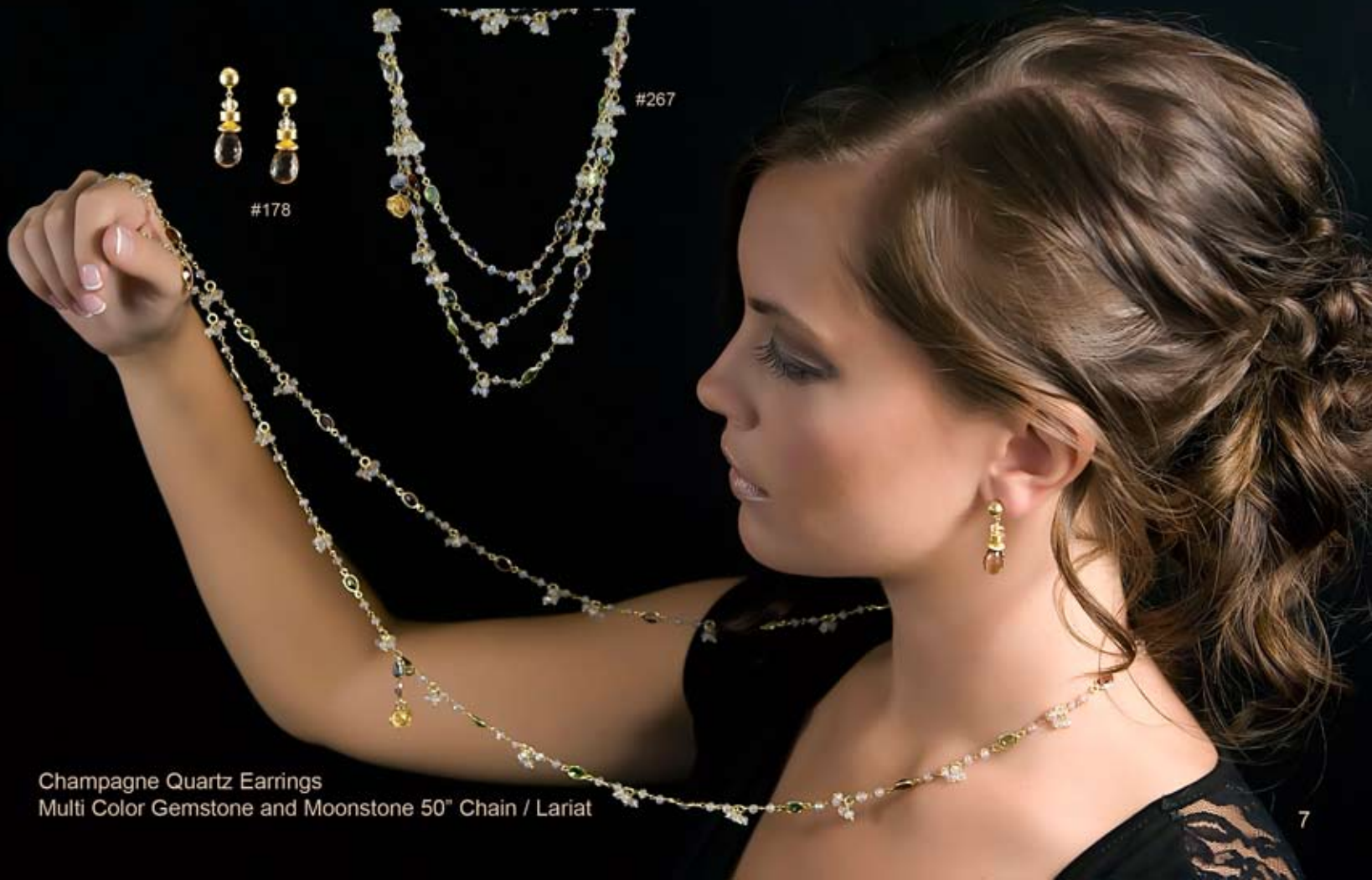
Champagne Quartz Earrings Multi Color Gemstone and Moonstone 50" Chain / Lariat