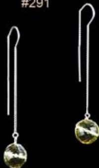
Green Gold #291