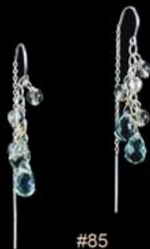
#85 Blue Quartz