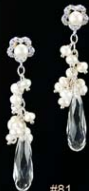
#81 Pears and Quartz