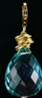
Add an enhancer for sheer elegance...