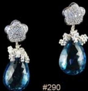
#290 London Blue Topaz