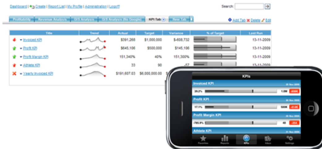
Figure 3 Content tailored to fit the device

The mobile software client should optimize the delivery of content based on the size of the screen. Emphasis should be placed on “bite size” reports such as KPI sparklines and bullet charts. Mobile reporting should be designed to highlight those strategic KPIs that are of the greatest concern, as well as drive action, through exception reporting. This is not a contradiction to the point above, but an acknowledgement that what works well in a full size browser, is often not ideal on a mobile device. For example, delivering an analytical dashboard with eight to ten reports on it would be a terrible user experience on a phone.