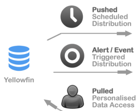
Figure 1 Mobile BI Delivery

Both sets of users demand flexible data access and the ability to access and analyze data in a uniform manner, regardless of the device used, be it PC, laptop or smart phone. In simple terms, no matter how the end-user accesses their corporate data, what they see should be the same.