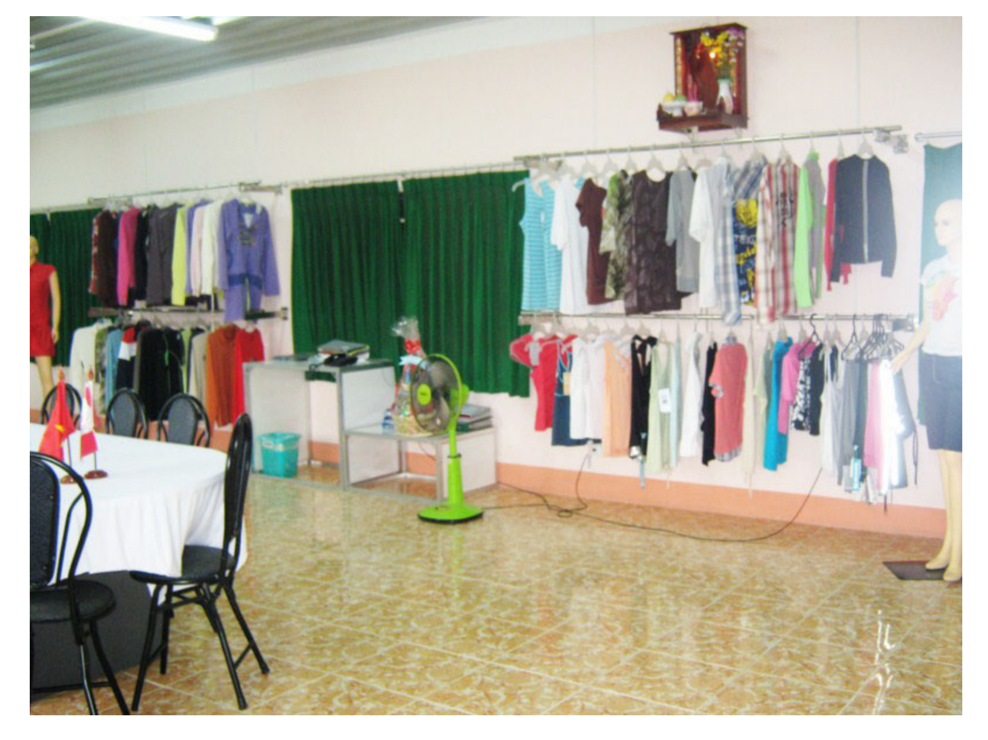
10 Show room 2