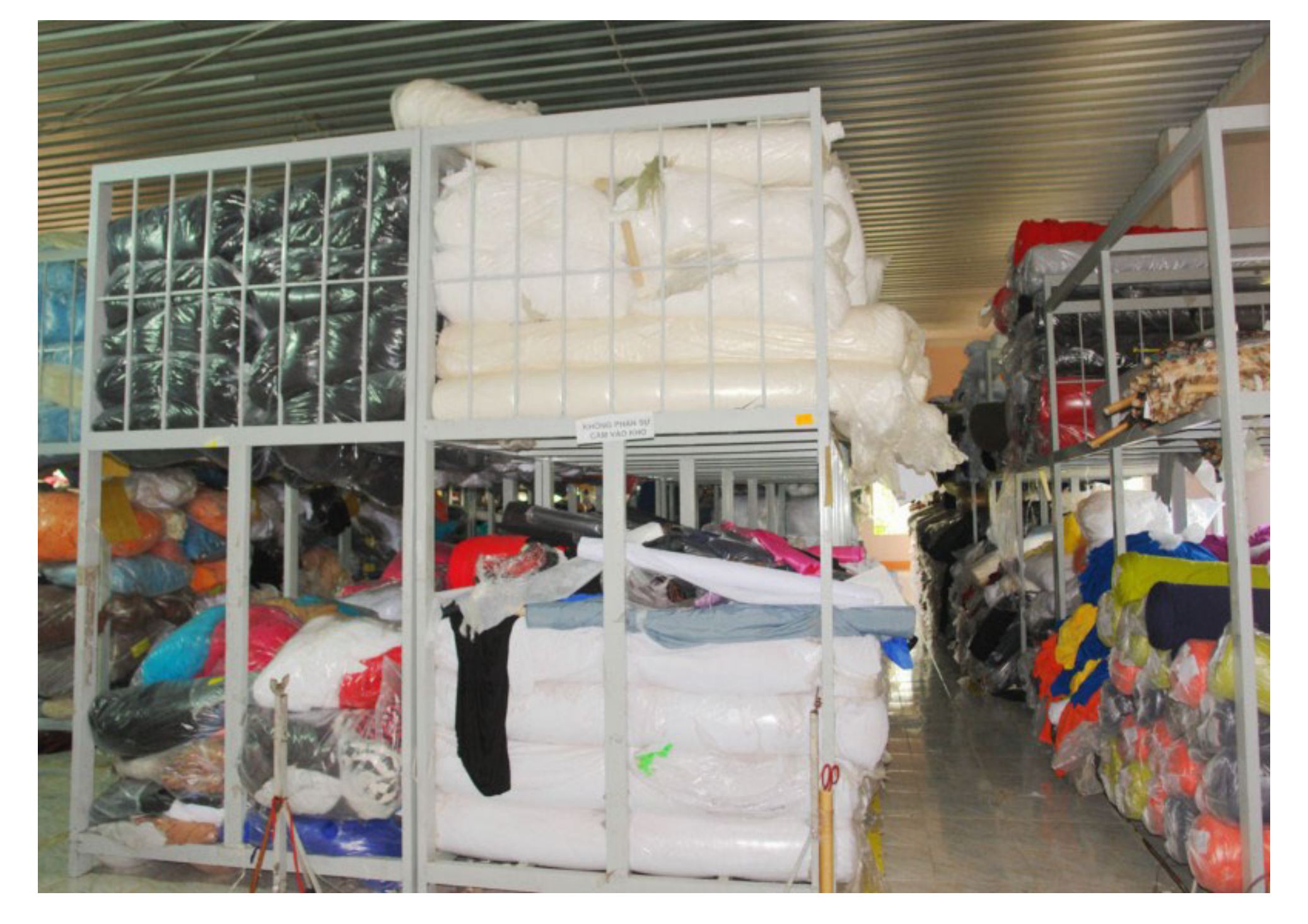
13 Fabric warehouse 2