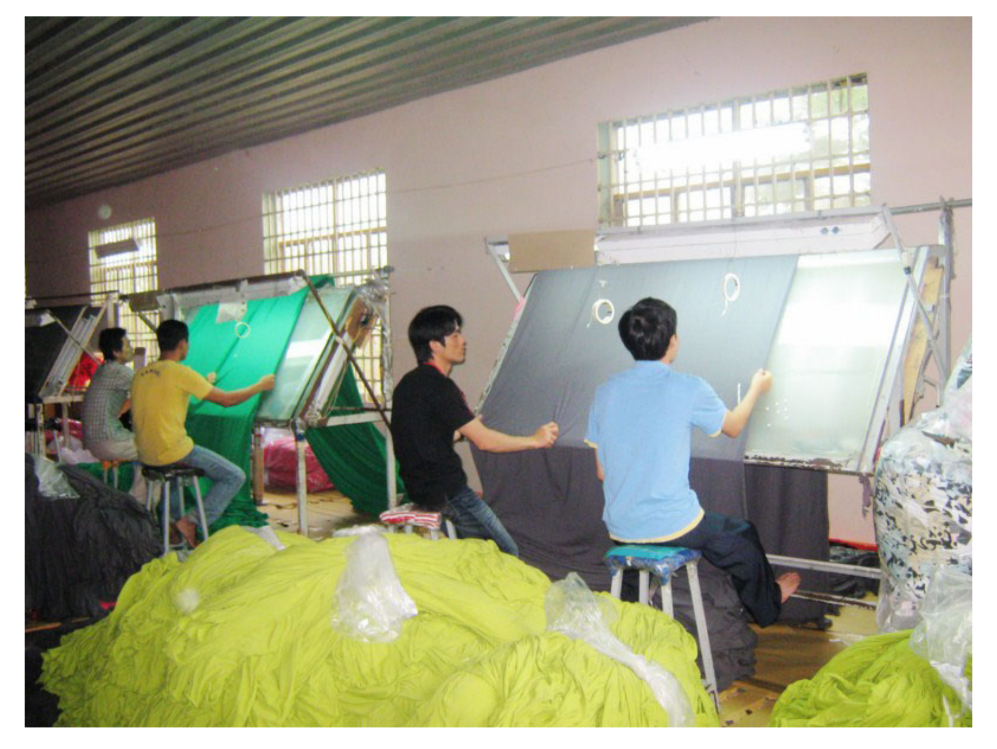
14 Fabric checking area