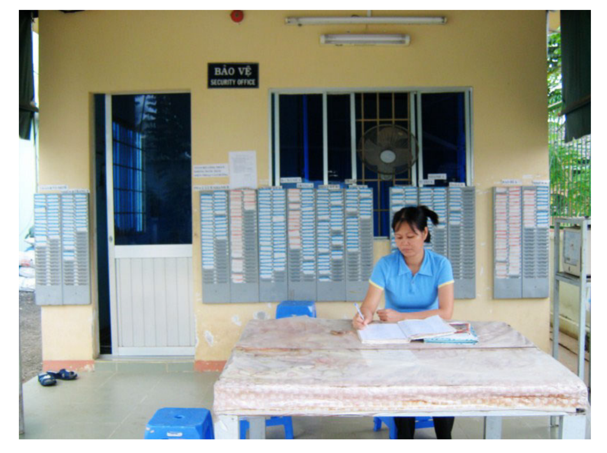
05 Security office