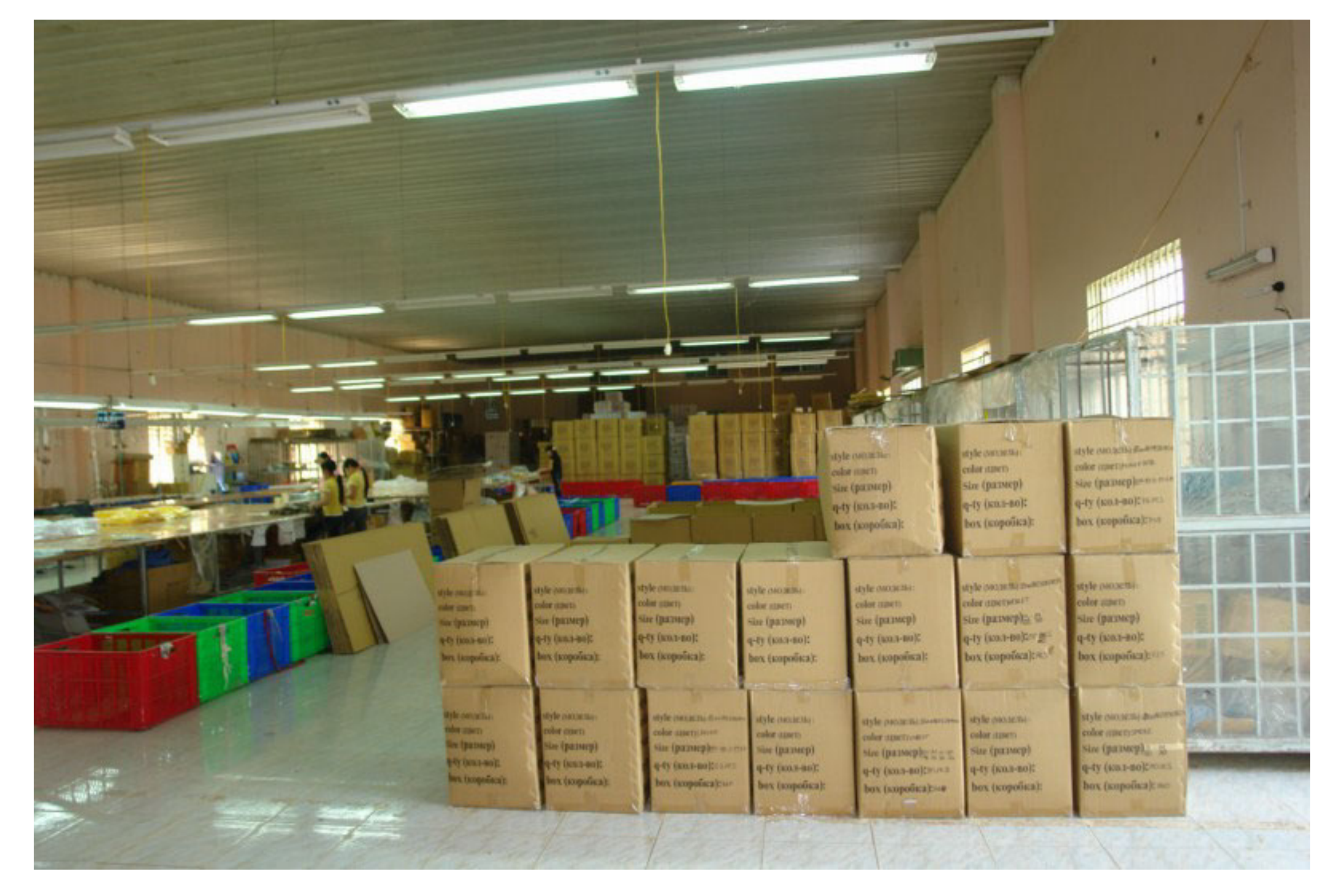
21 Packing area - finish warehouse