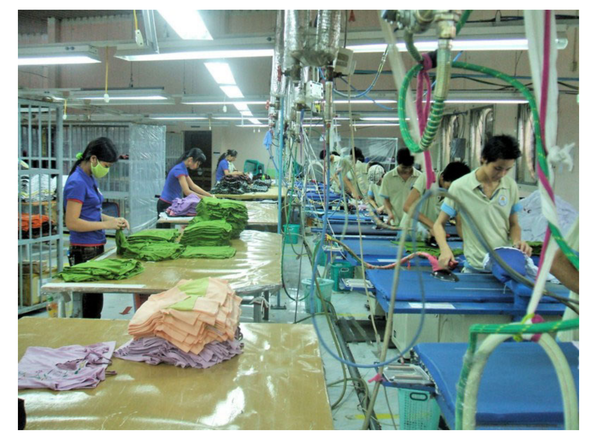
20 Ironing line