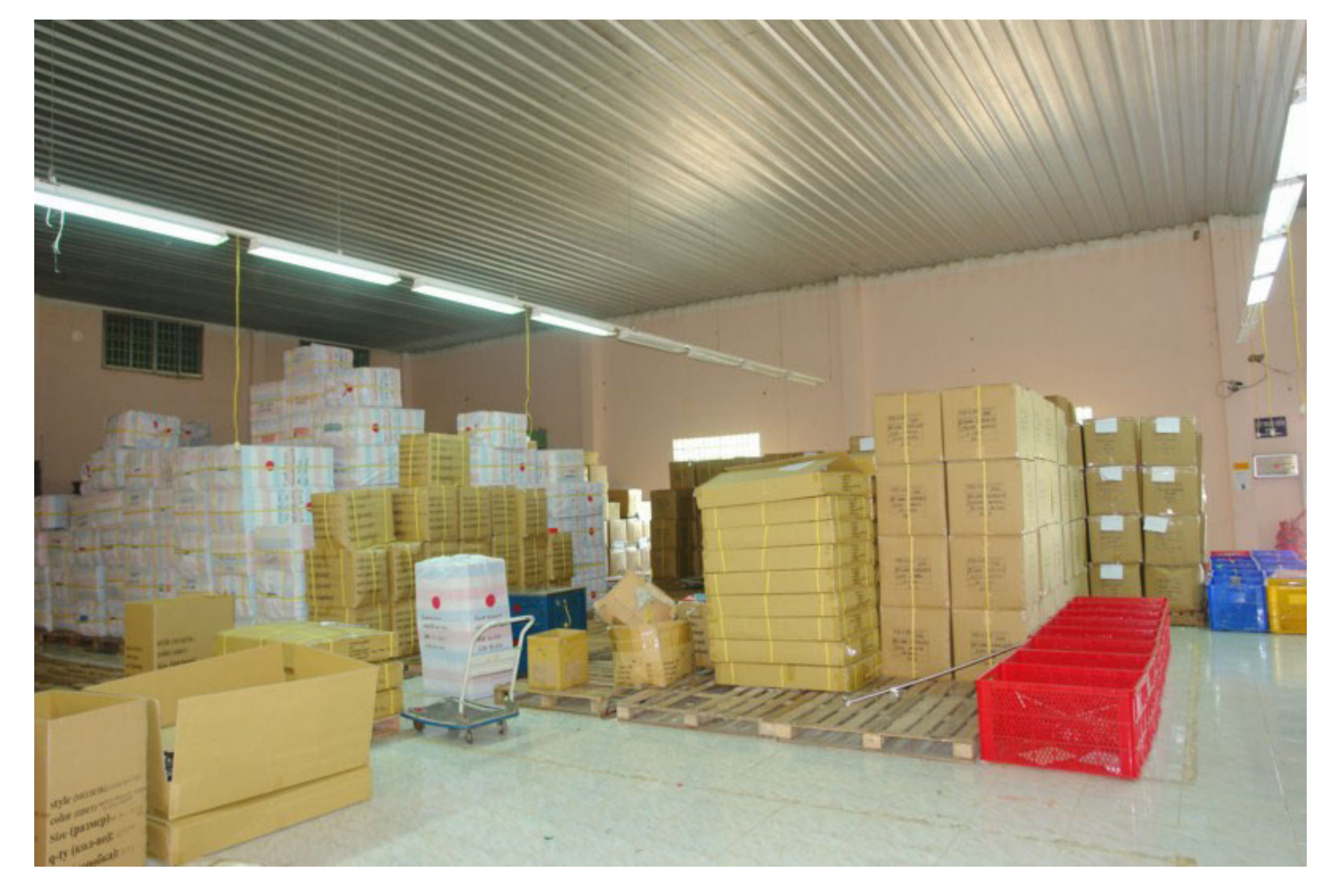
22 Finish warehouse