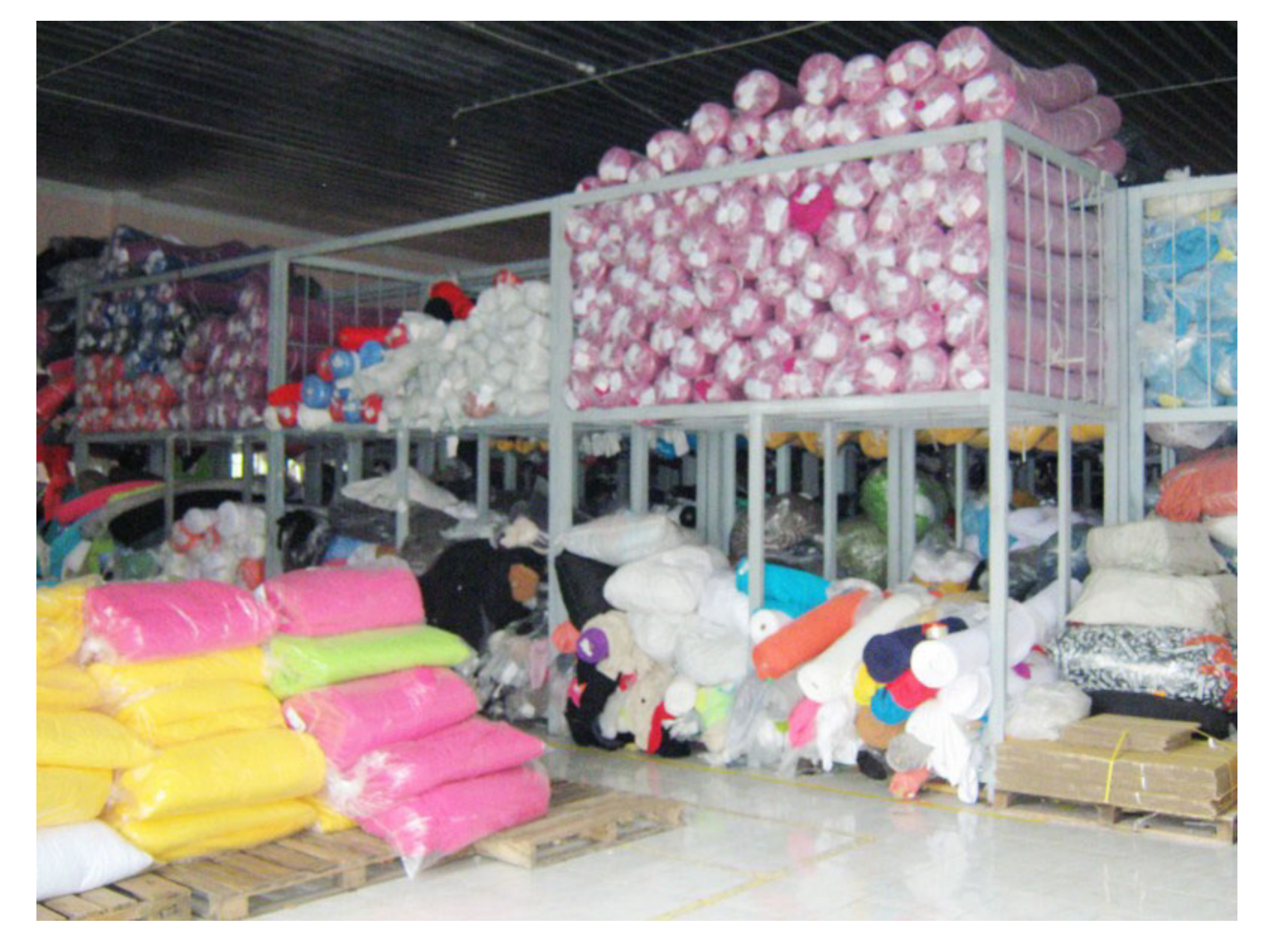
12 Fabric warehouse 1