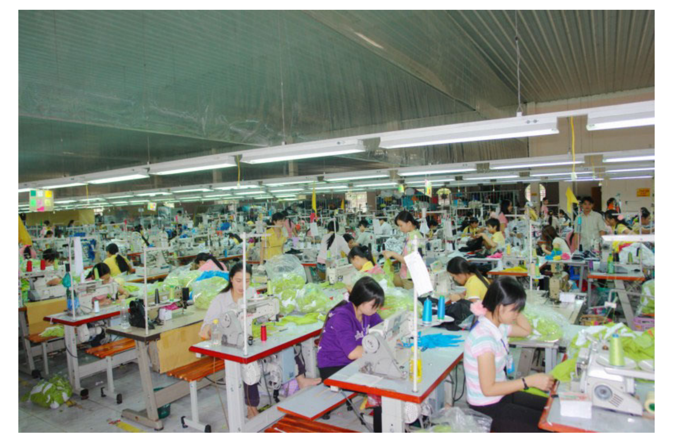
18 Sewing lines