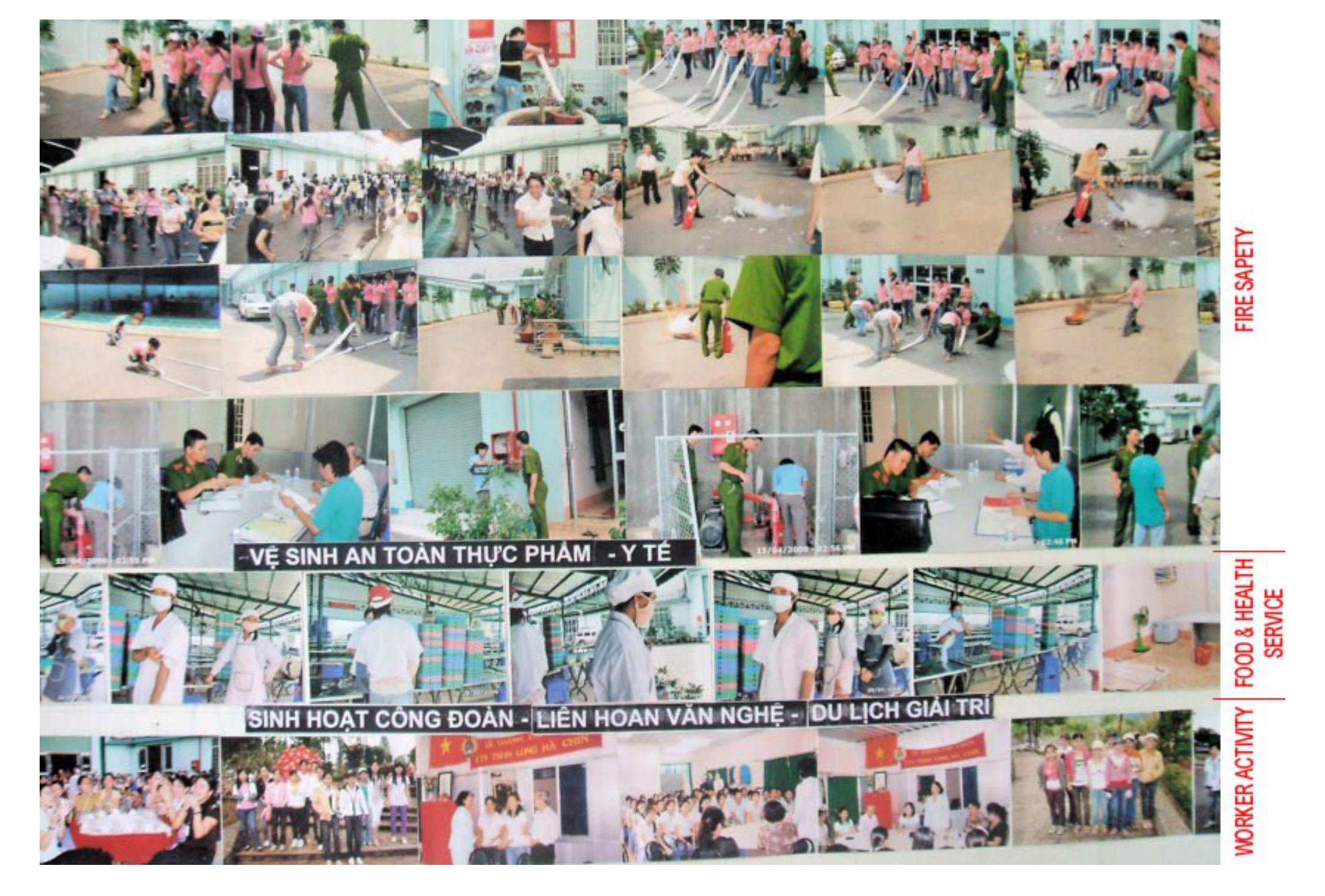
08 Fire safety & food & worker activity