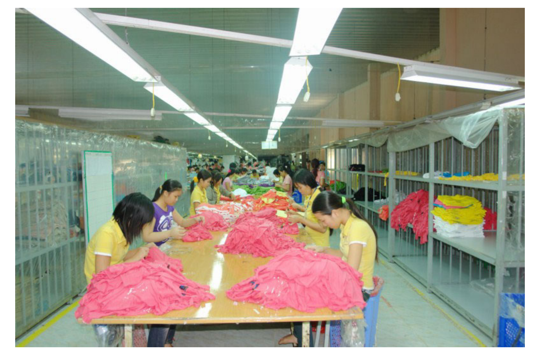
19 QC area