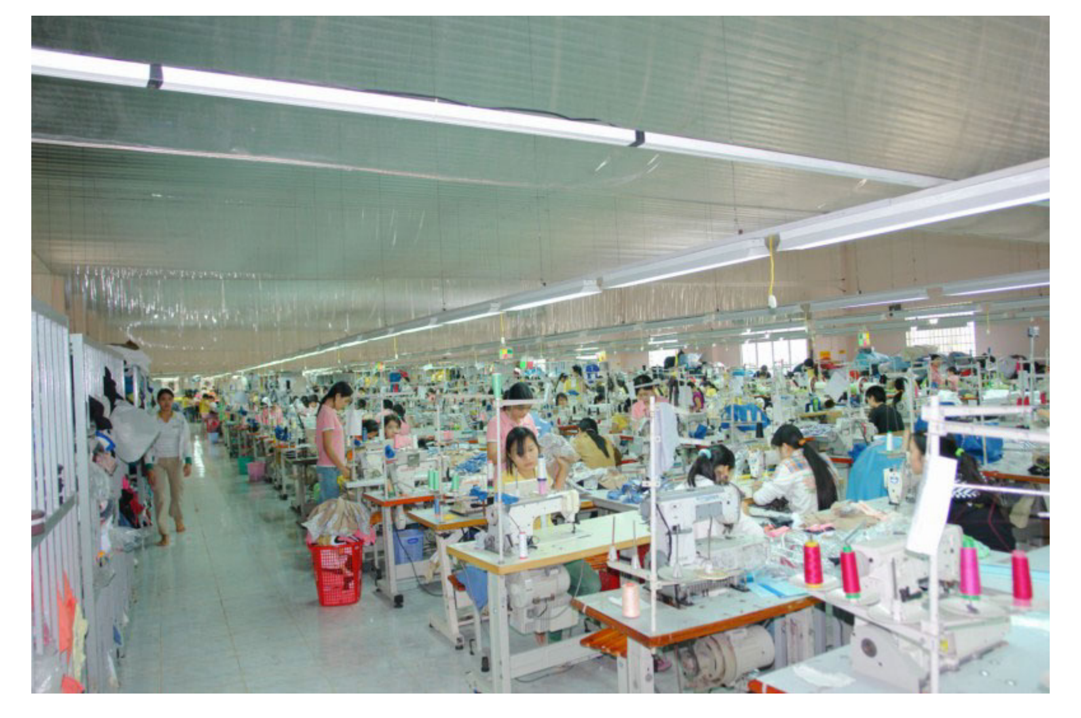
17 Sewing lines 2