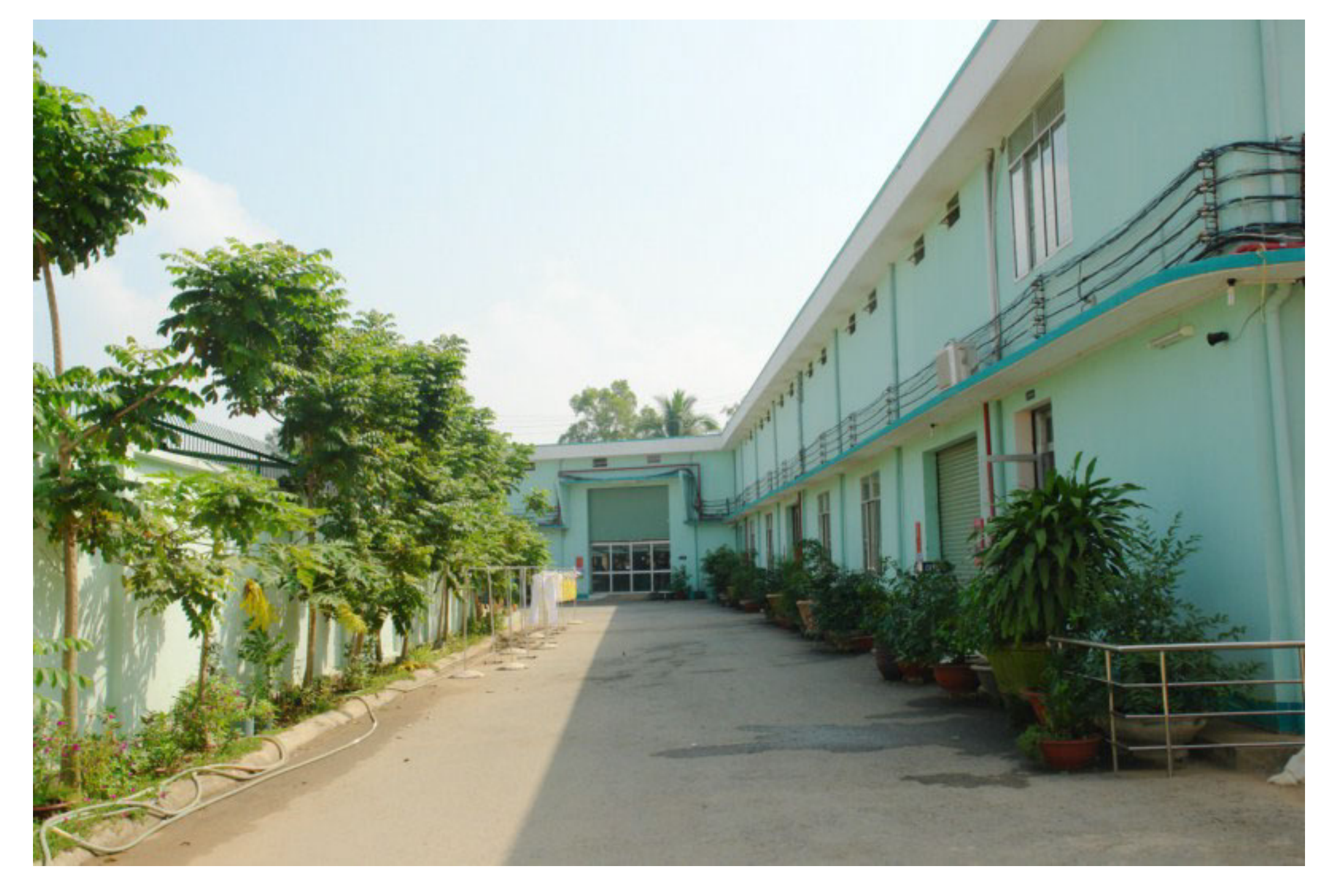
03 Factory internal road - from main gate