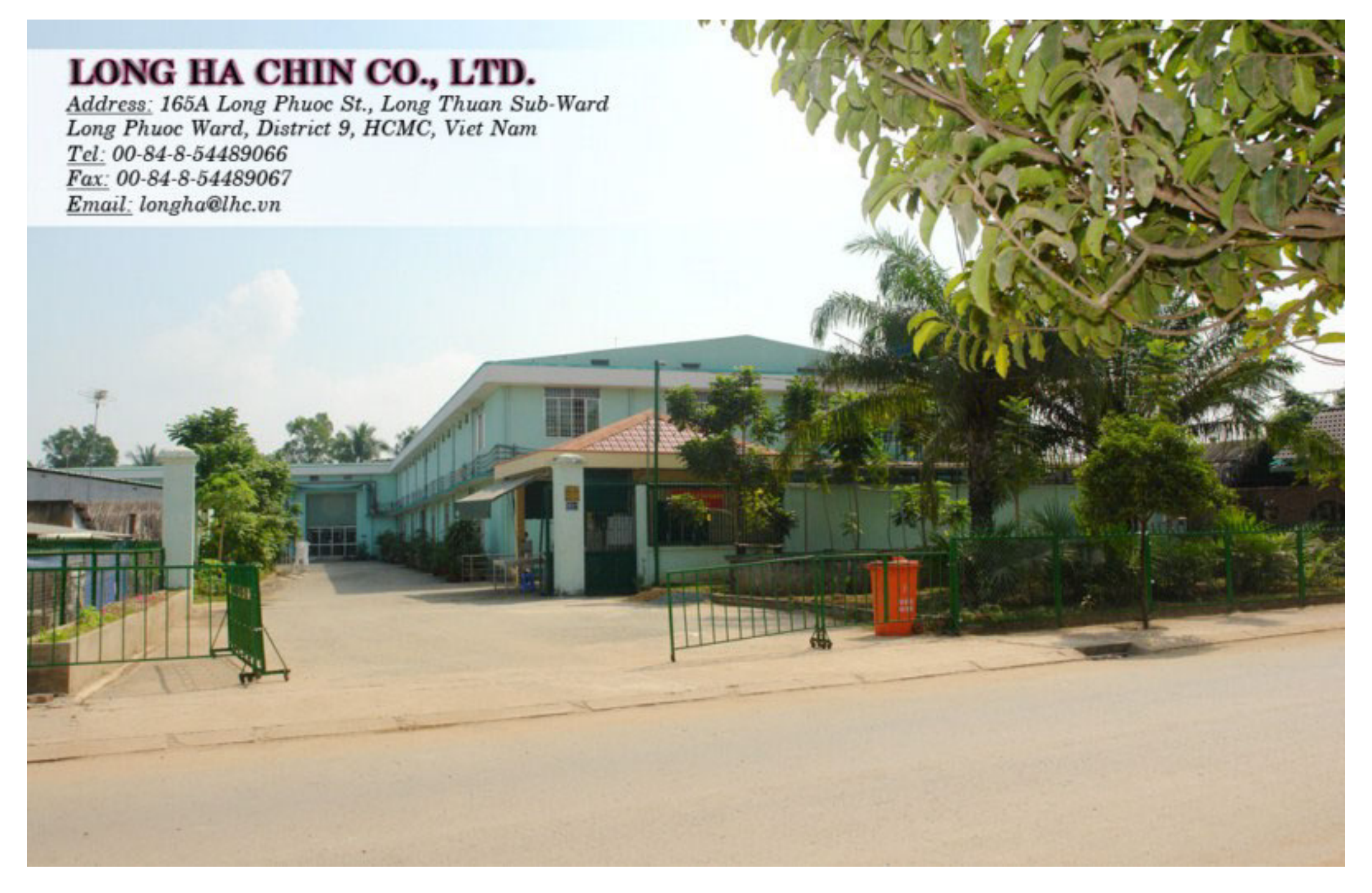
02 Factory gate 1