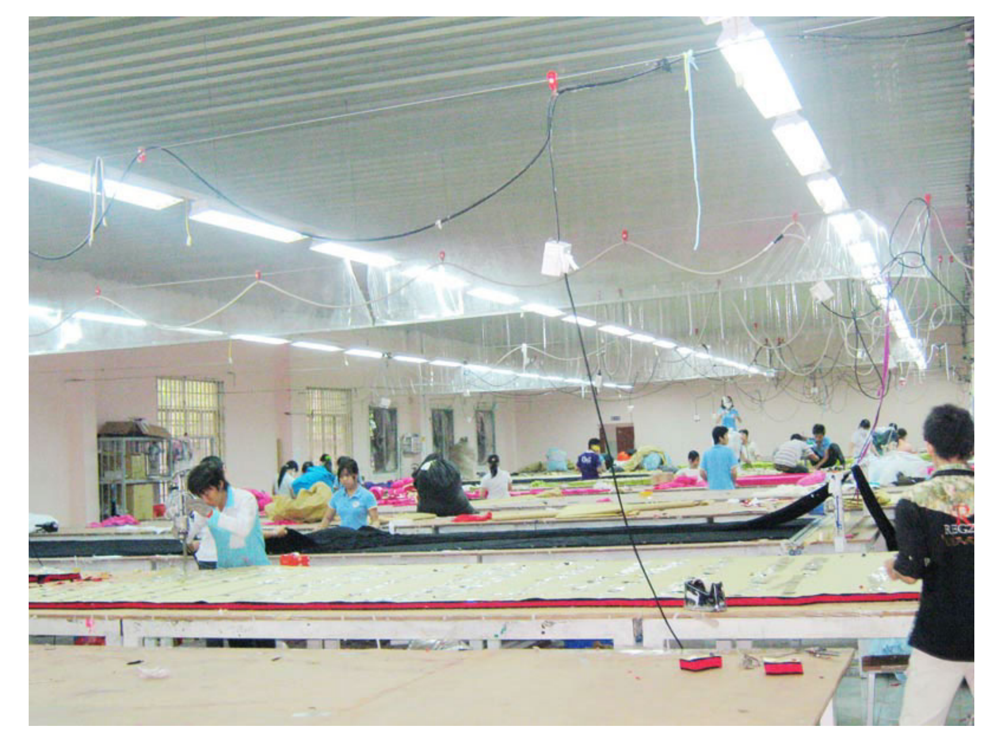
15 Cutting area