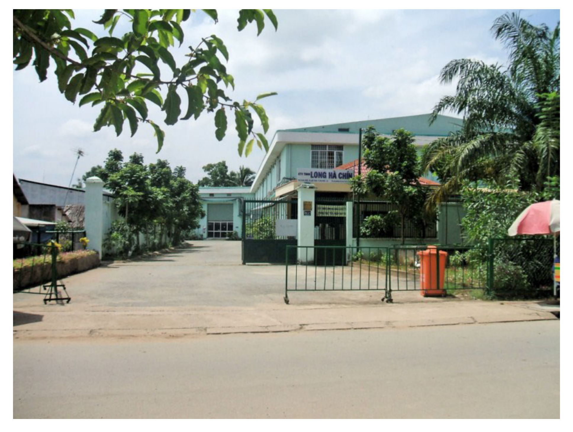
01 Factory gate