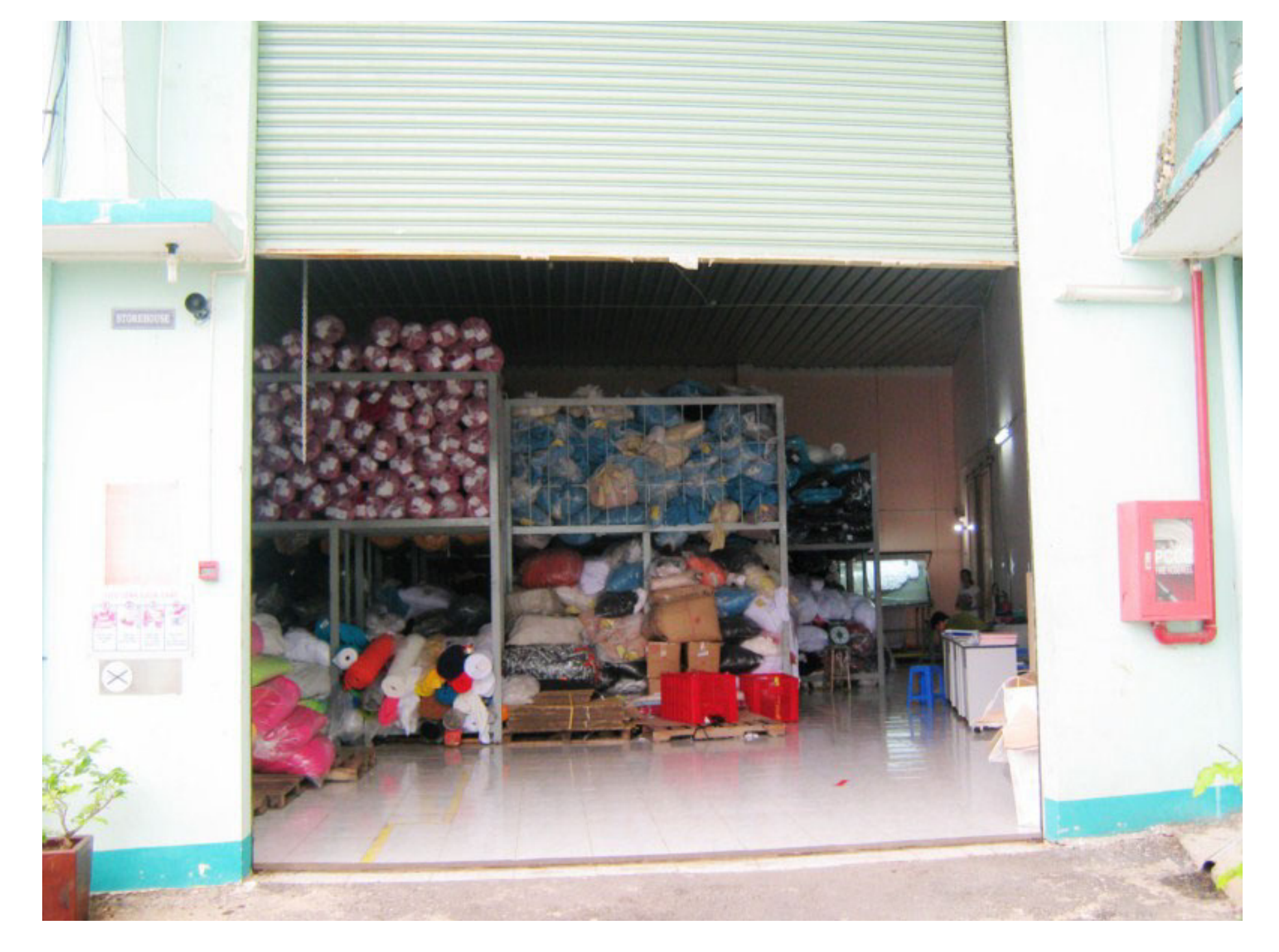
11 Fabric warehouse