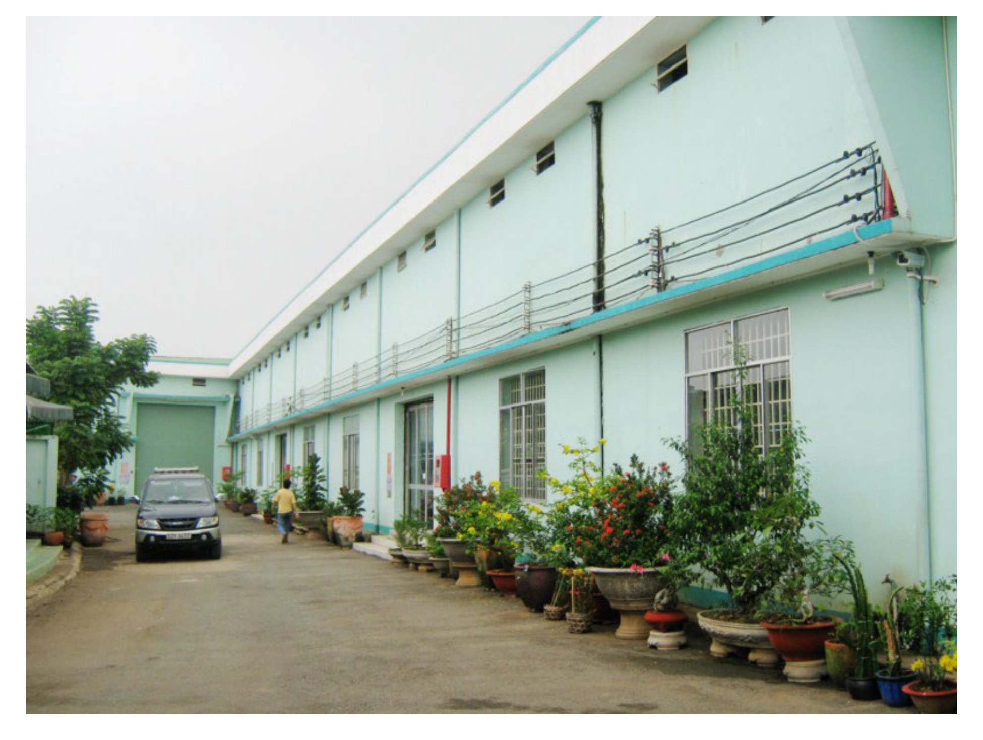
04 Fatory internal road - to fabric warehouse