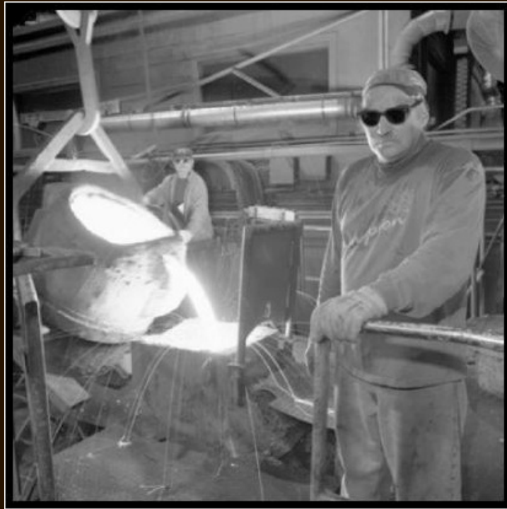
Iron Pourer in Erie, Pennsylvania