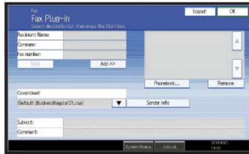
Figure 2: FAX Addressing Screen