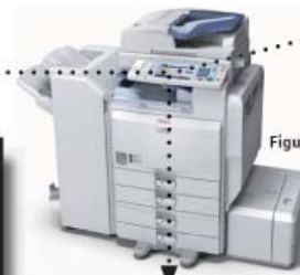
Figure 1: Ricoh MFD

MFD panel provides access to feature rich fax server solution features within XMediusFAX or OpenLine