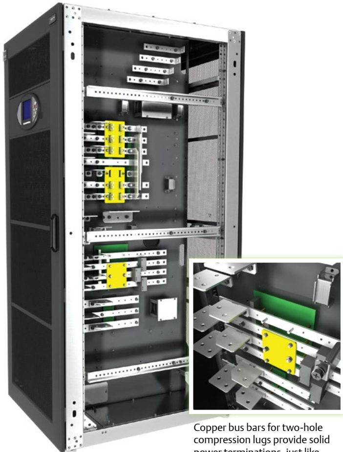
Copper bus bars for two-hole compression lugs provide solid power terminations, just like enterprise UPS systems