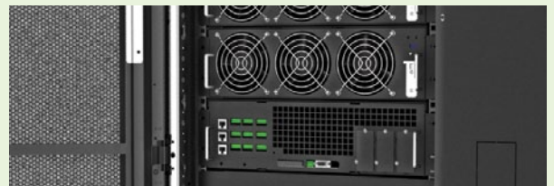
Independent Static Bypass assembly with Liebert Intellislot ports