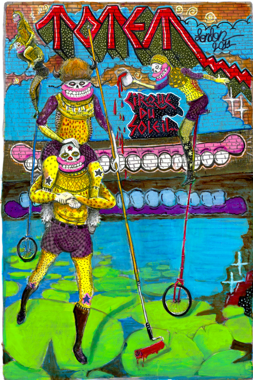
TOTEM by Sweet Toof