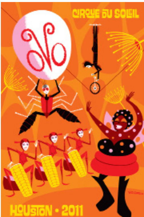
OVO by Shag