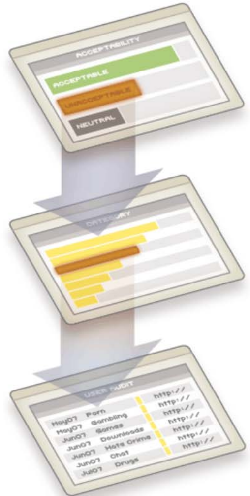
Interactive Drill-Down Reporting