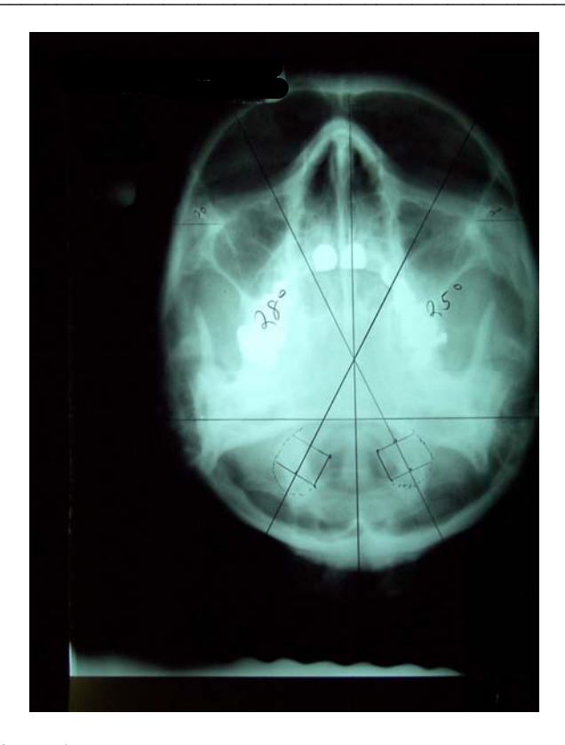
Figure 1 SHOWS CONDYLE CONVERGENCE ANGLES NECESSARY TO TAKE RIGHT AND LEFT BLAIR PROTRACTO VIEWS

The Base Posterior view was used to plot and measure the convergence angles representing the longitudinal axis of the respective atlanto-occipital articulations. The A-P Open Mouth view was used to study lateral deviations of the neural rings, which may cause brainstem pressure. Blair Oblique Protracto-views of each atlanto-occipital articulation were made with the patient turned in a positioning chair and then secured in head clamps at an angle equal to the convergence angle of the articulation being studied, so that the central ray was directed obliquely anterior-to-posterior along the convergence angles respectively.