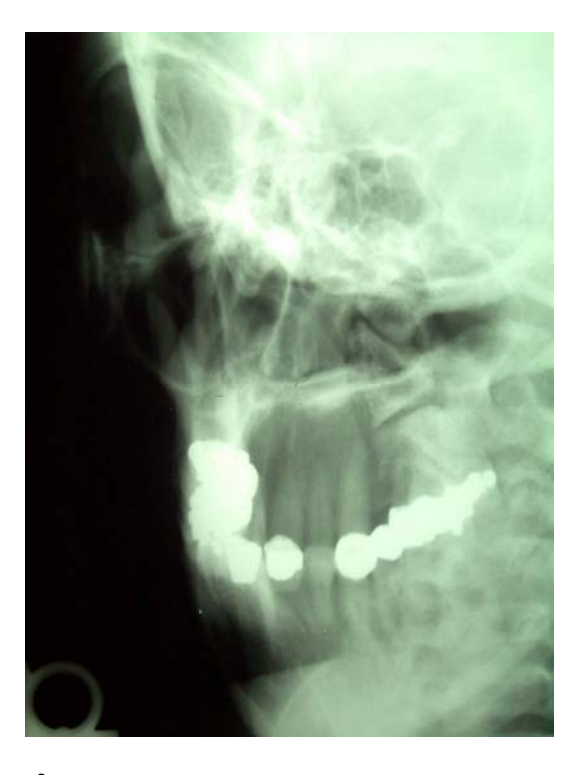
Figure 2 RIGHT BLAIR PROTRACTO VIEW EXHIBITS ALIGNMENT OF THE CONDYLE-LATERAL MASS EDGE. THIS WOULD BE LISTED AS EVEN

These appositional judgments of each articulation may then be combined to deduce the actual unilateral or ambilateral misalignment pathways of atlas in relation to occiput, and an anatomically accurate misalignment listing and adjustive formula may thus be derived.<sup>21</sup>