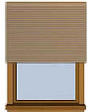
Blind wider than the Window Frame

Remember, if you have a question, call customer service first. They can walk you through any question or concern you may have.