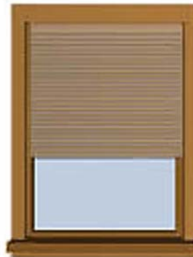
Blind narrower than the Window Frame