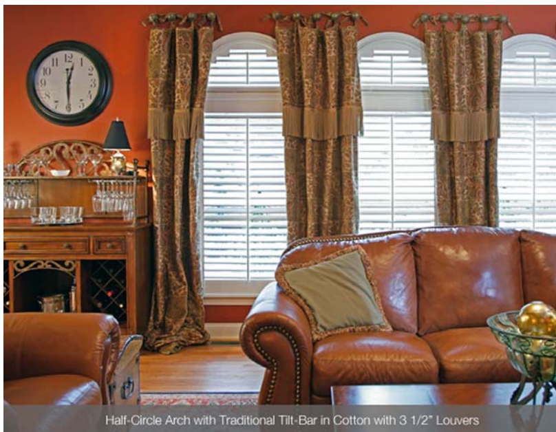
Half-Circle Arch with Traditional Tilt-Bar in Cotton with 3 1/2" Louvers

Faux wood provides you with 100 percent vinyl shutters designed for durability. It can handle water, abuse and warping, and is perfect for high humidity areas such as the kitchen and bath.