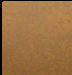
Chocolate + Si Si Tan BROWN SLATE