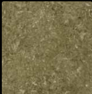
Best Bronze + Cream GREEN VINEYARD