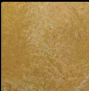
Gallant Gold + Cream GOLD SANDSTONE