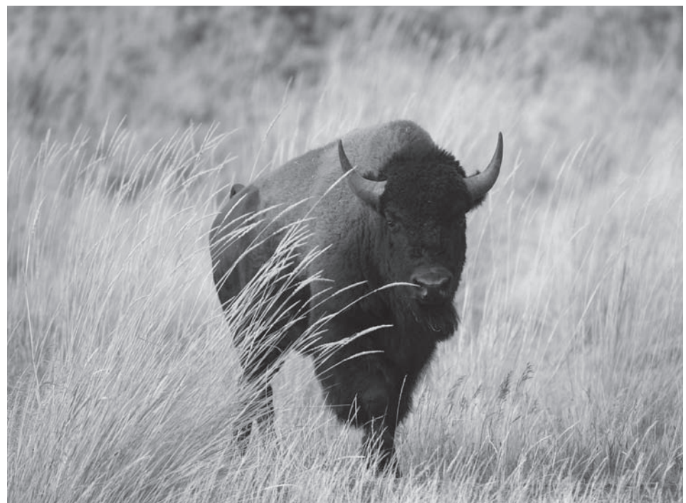
Thanks to determined conservation efforts, the American bison once again roams the grasslands of Yellowstone National Park.

Included entrances: Bryce Canyon National Park