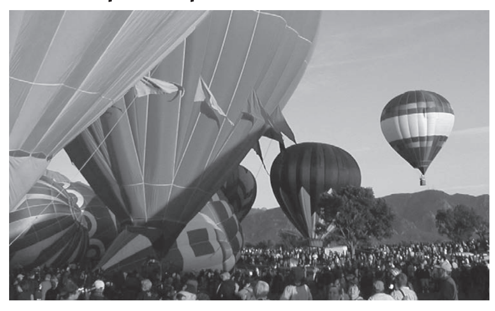
Each year, the skies outside Albuquerque play host to a one-of-a-kind celebration.