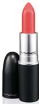
MAC at Selfridges

Skin myths exposed. Top skin tips and skin care myth busters. Free event.