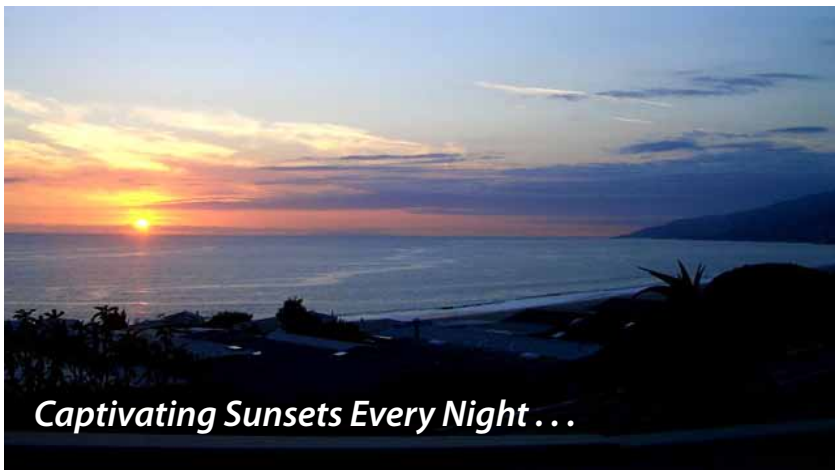
Captivating Sunsets Every Night . . .