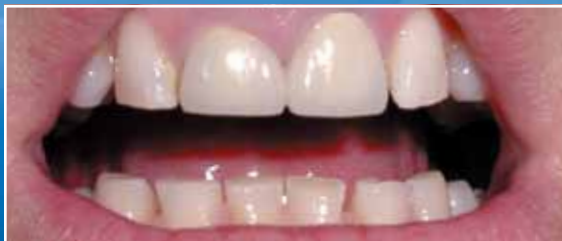
Bruxing can wear down and destroy your teeth.

Do you wake up with a stiff, tired jaw? Are your teeth sensitive to cold drinks? If you answered yes to either of these questions, you may be grinding or clenching your teeth during sleep. Grinding of the teeth is a medical condition called bruxism. Over time, bruxism will result in the wearing down of your natural tooth enamel. In fact, studies suggest that those who grind and clench their teeth experience up to 80 times the normal wear per day compared with those who do not.